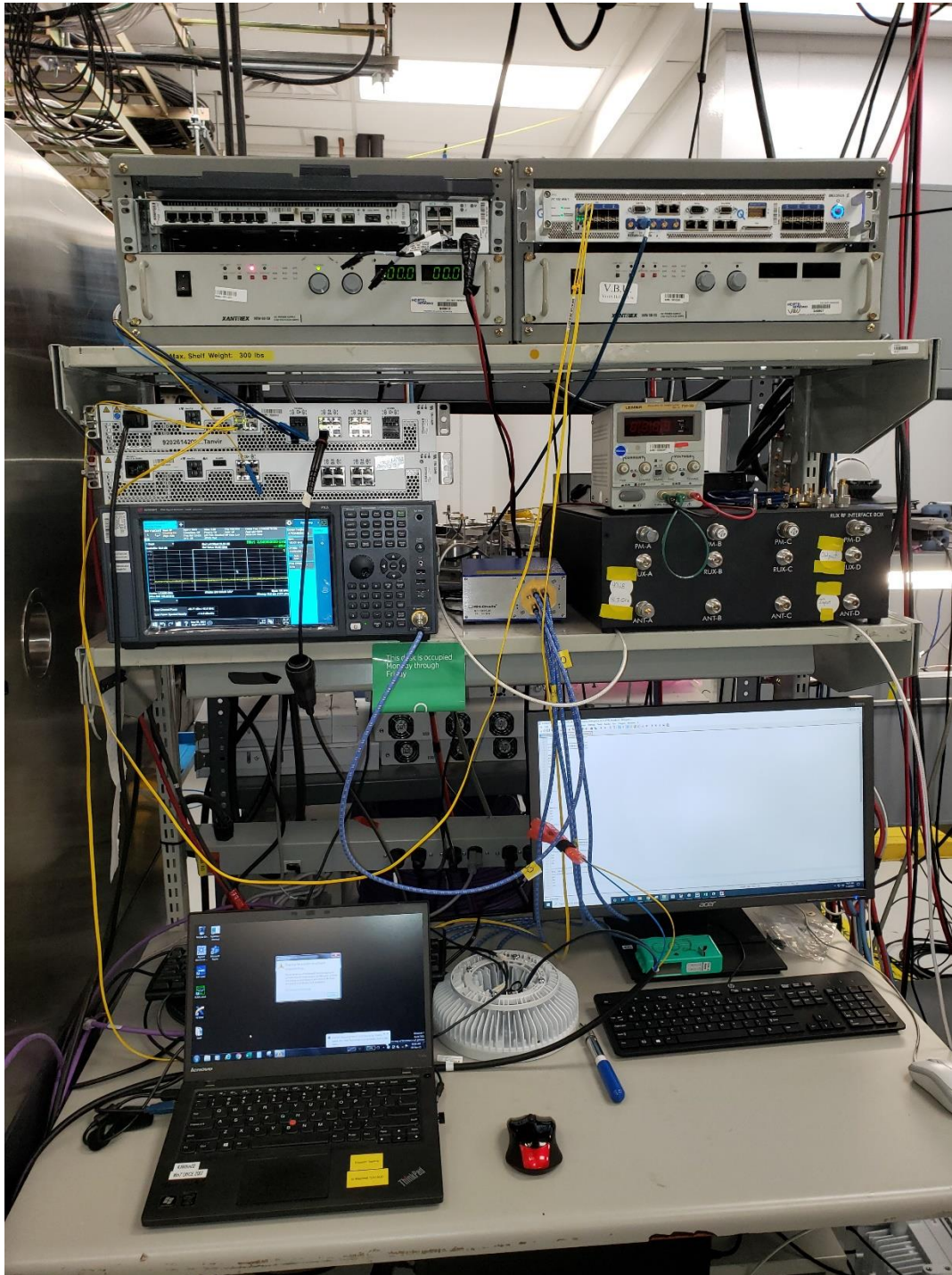
Figure 2: Conducted test setup