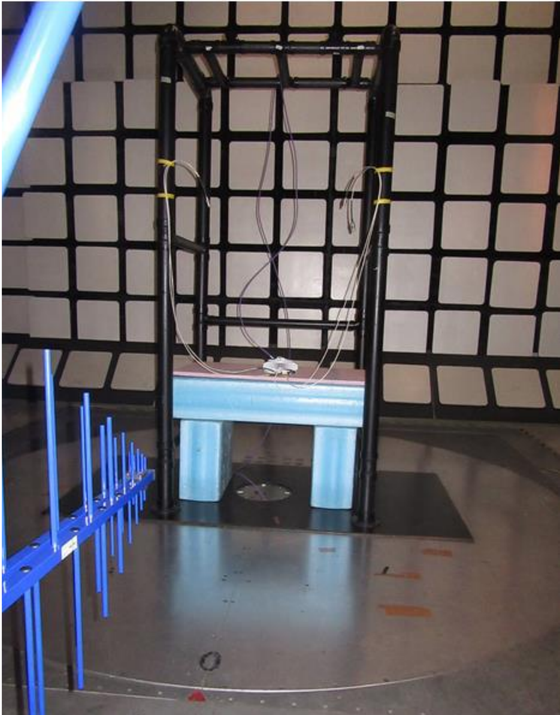
Figure 1: Radiated Test setup (30 to 1000MHz)