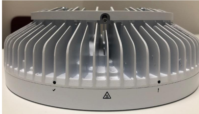
Figure 3: Dot 44Kr B77D Side View