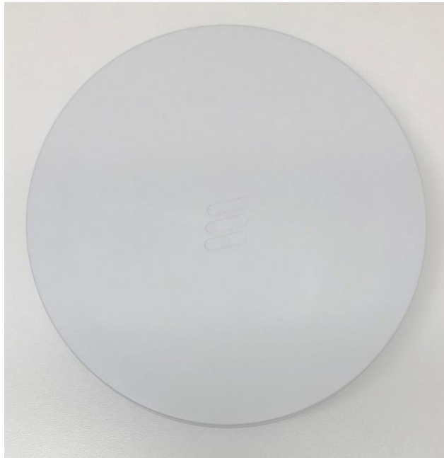
Figure 1: Dot 44Kr B77D Top (Radome) View