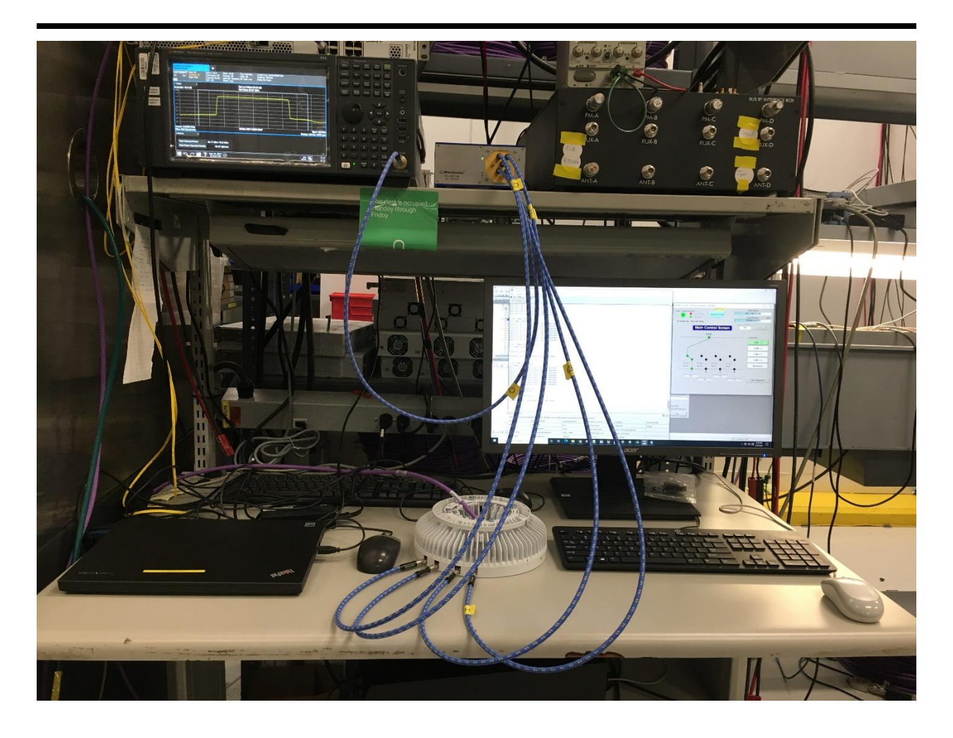
Figure 2: Conducted test setup