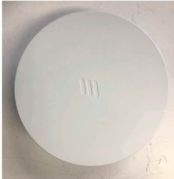
Figure 1: Dot 4459 B41K Top (Radome) View