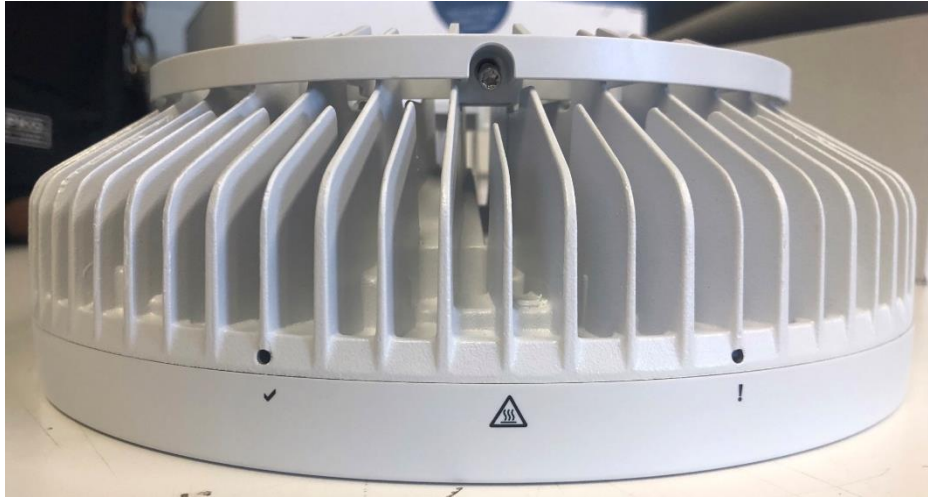
Figure 3: Dot 4459 B41K Side View