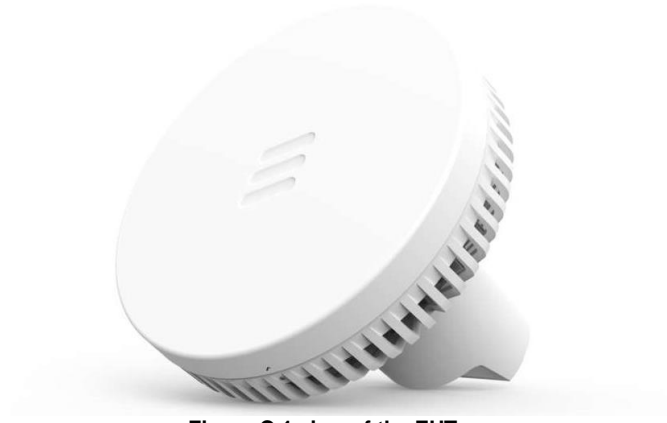
Figure C.1 view of the EUT