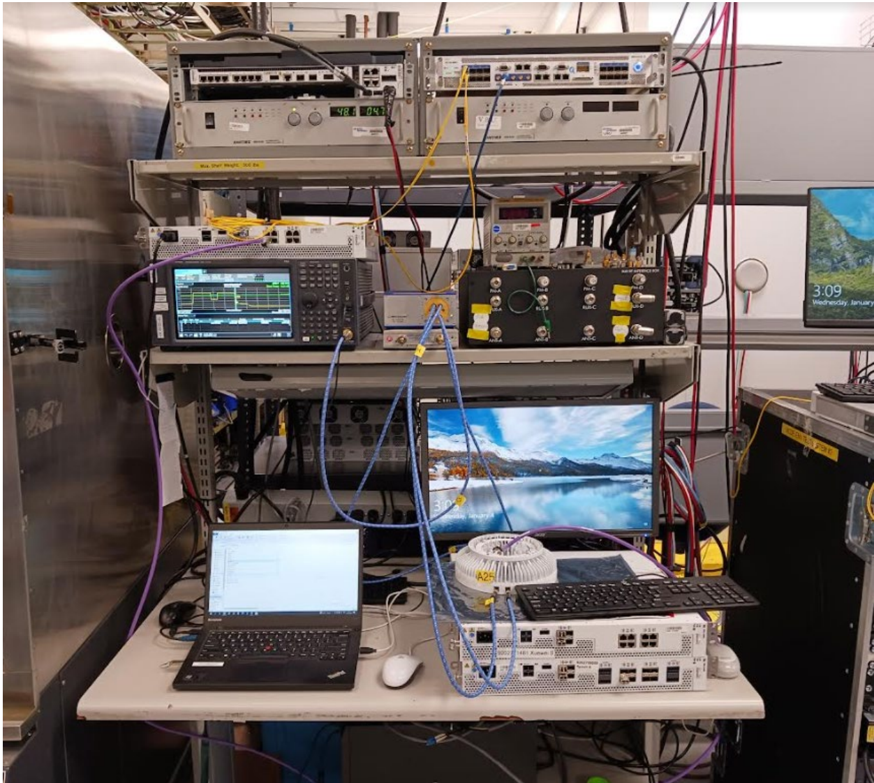
Figure 1: Conducted Test Equipment