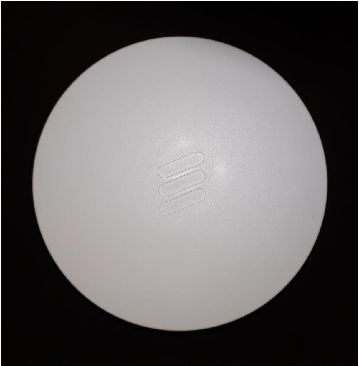
Figure C.1 Photograph of Ericsson Dot 2272 B5B13 (top view).