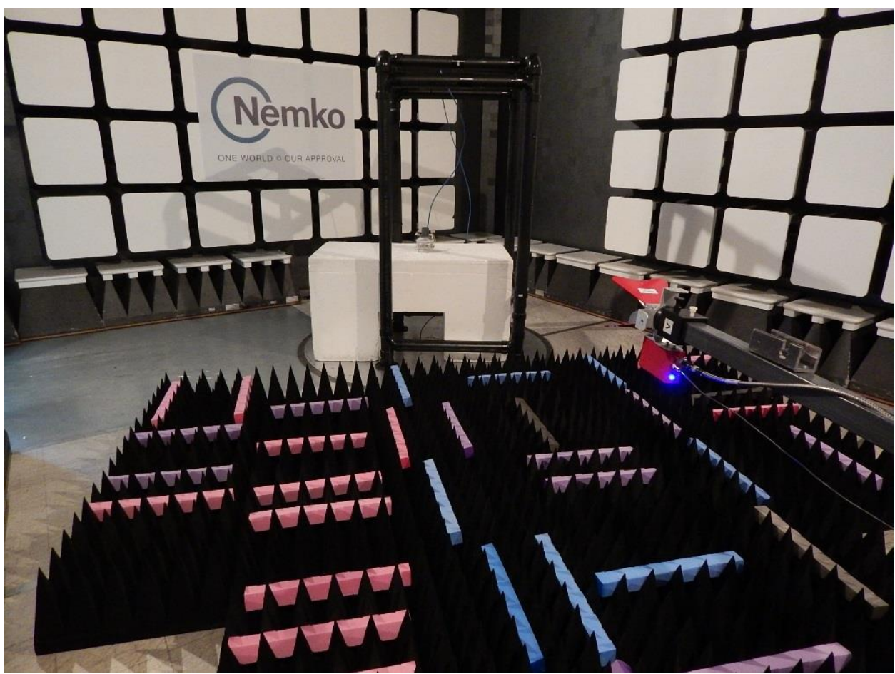
Figure 2: Radiated Test setup (frequency above 1000MHz)