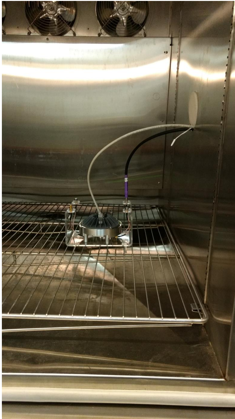
Figure 4: EUT test fixture in a thermal test chamber