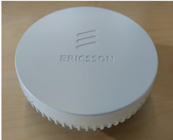
Figure D.1: Top view on the EUT front side.