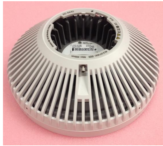
Figure D.2: Top view on the EUT back side.