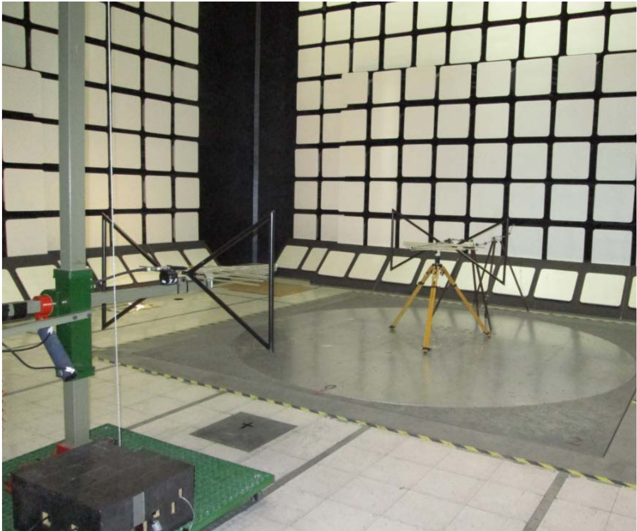
Signal Substitution Set Up