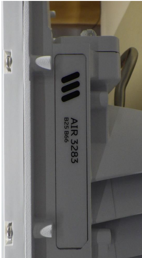
Label overlay view figure 3