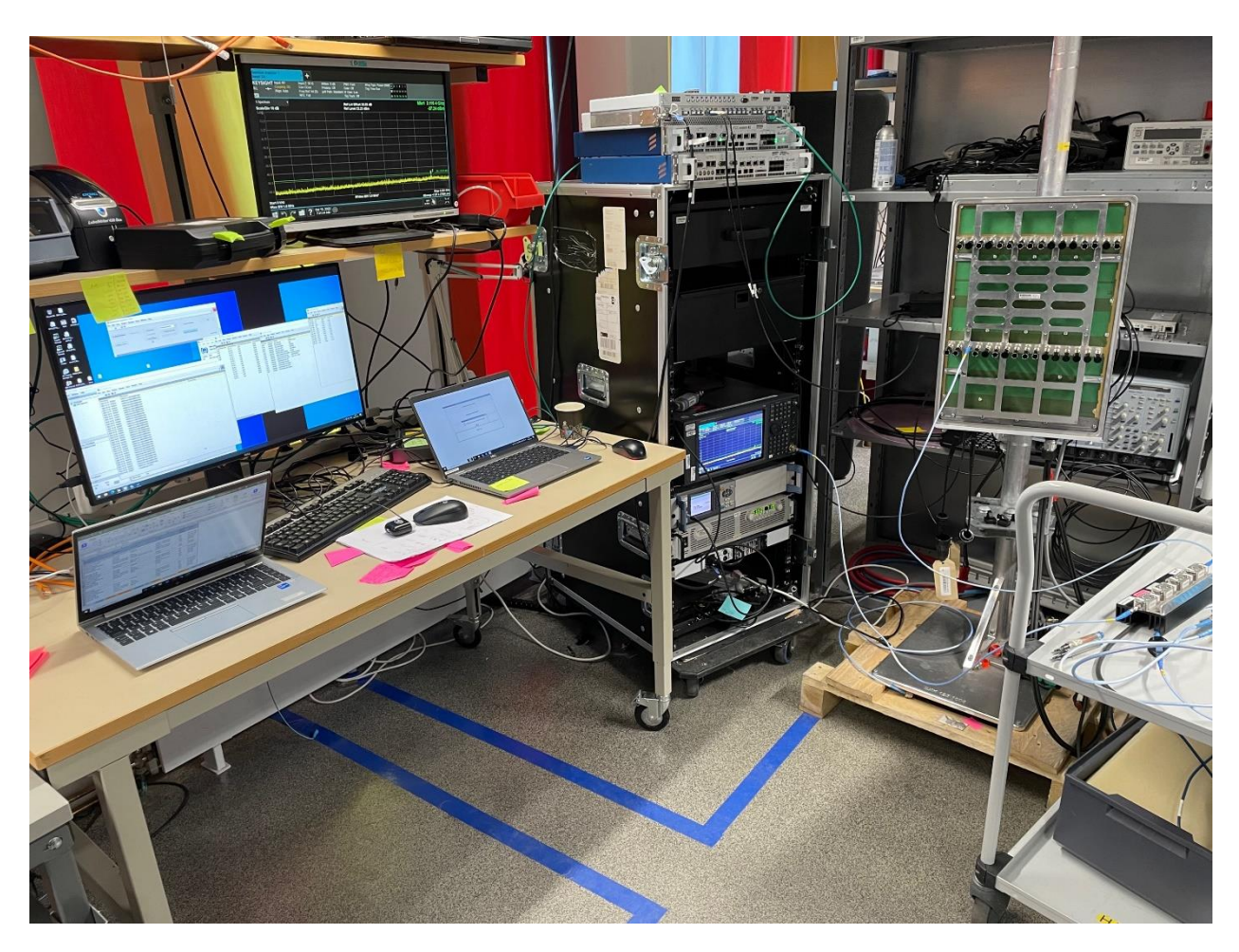
Conducted Lab Testing - Band Edge, Conducted Emisssions