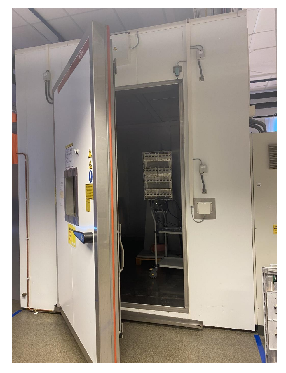
Extreme Temperature Lab Testing