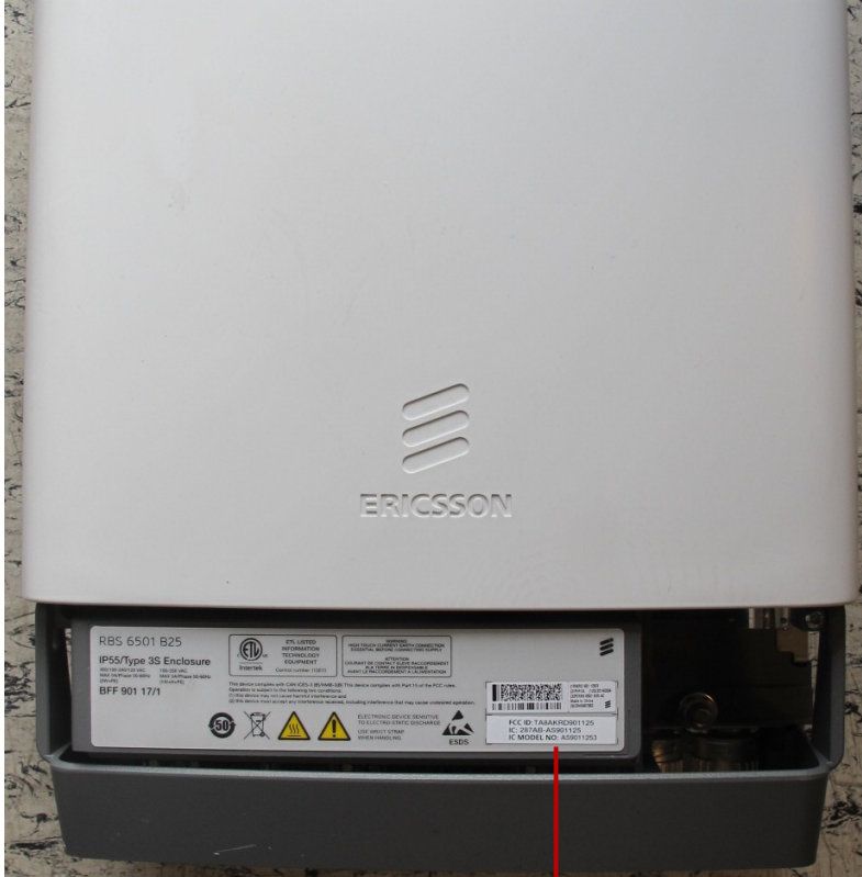
ID label for RBS 6501 B25, AC