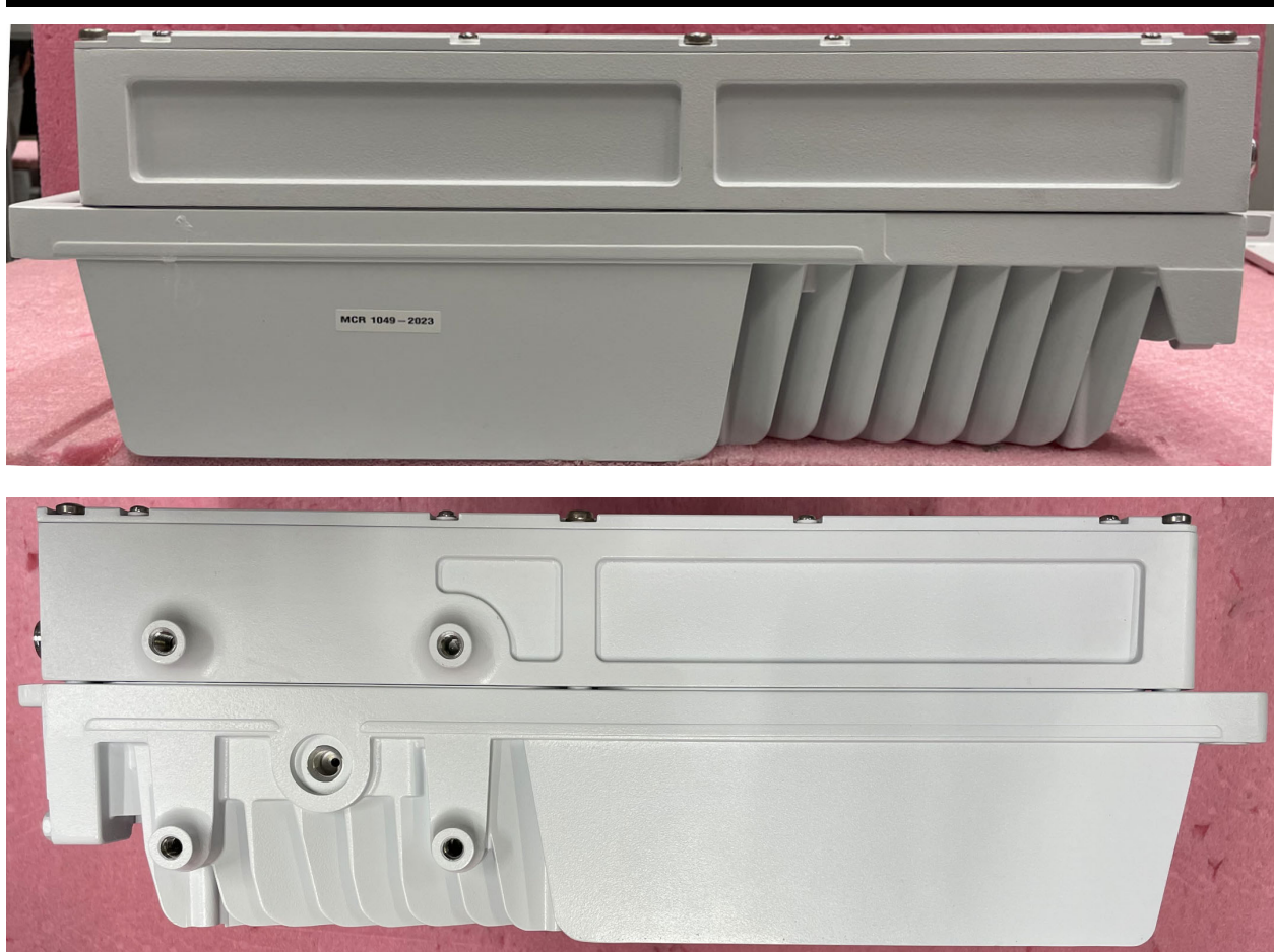
Figure 4: Radio 4890HP 48B2/B25 48B66 M01 Side View