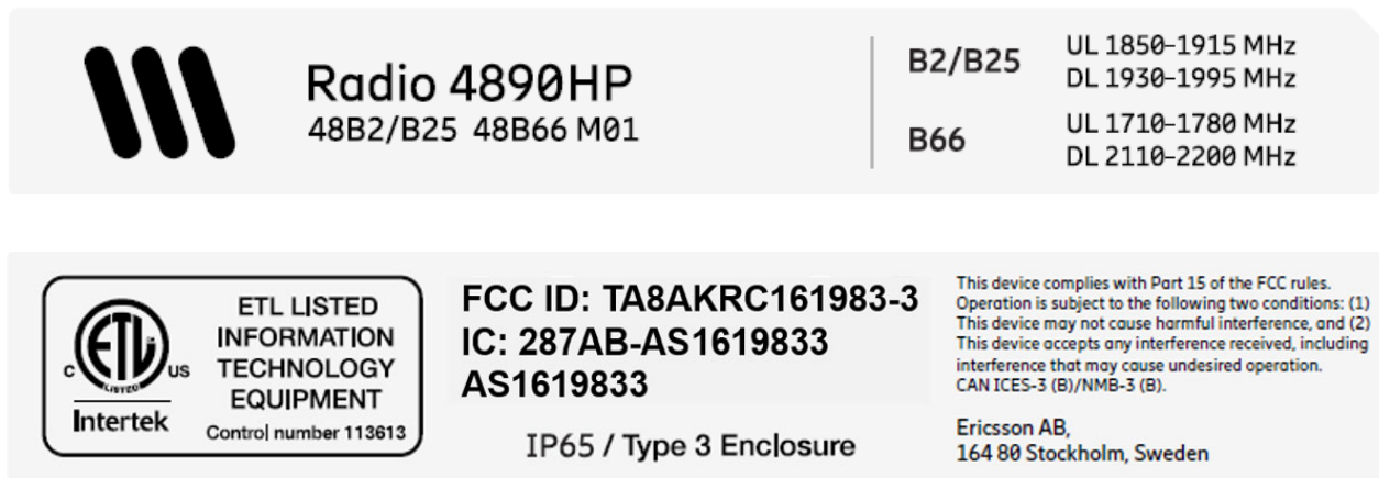
Figure 5: Radio 4890HP 48B2/B25 48B66 M01 Product Labels