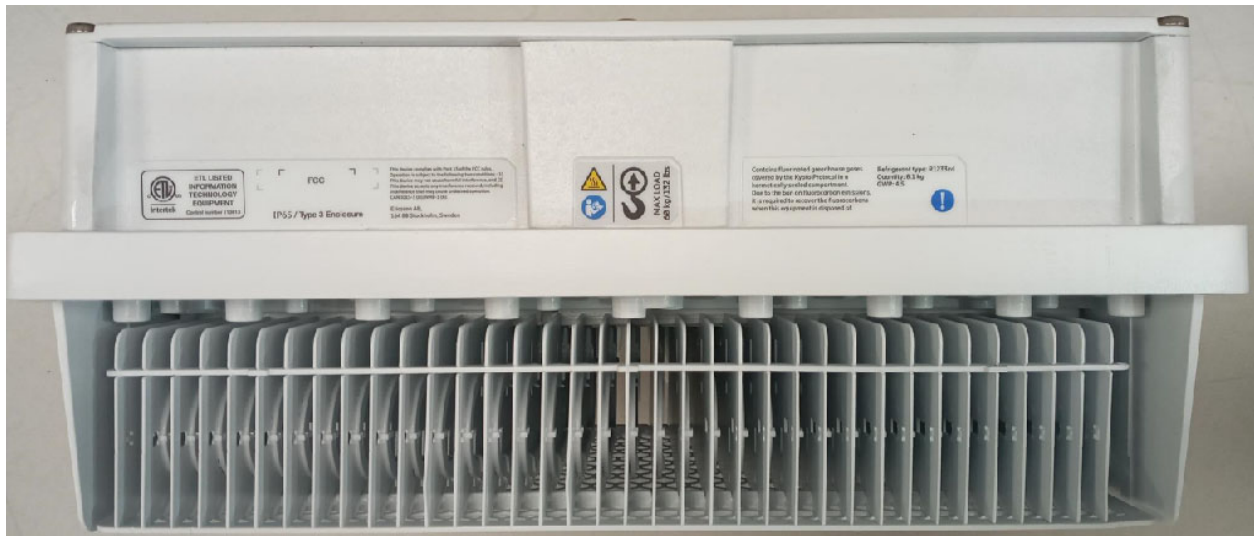
Figure 2: Radio 4890HP 48B2/B25 48B66 M01 Top / Handle View