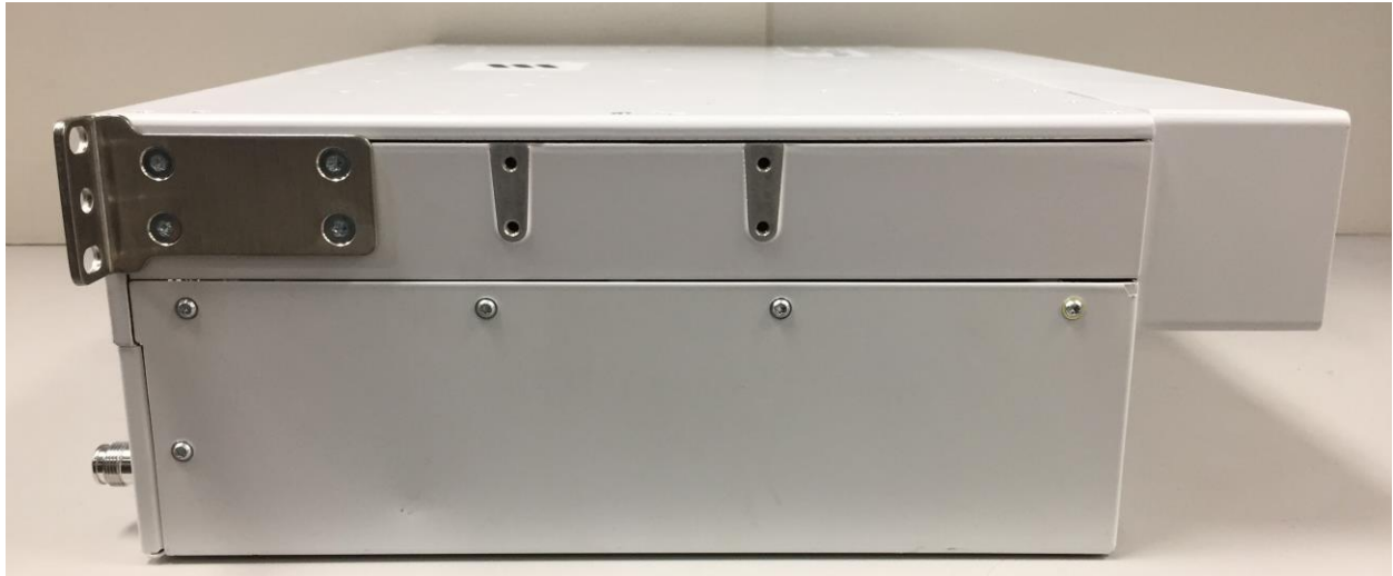
Figure 5: LPRU 4420 B25B66 Right View