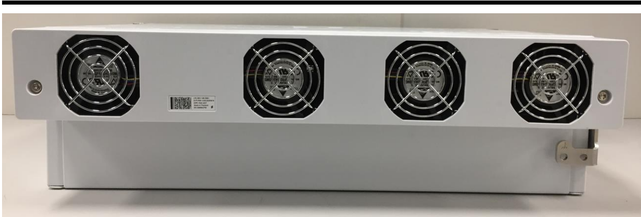
Figure 3: LPRU 4420 B25B66 Rear View