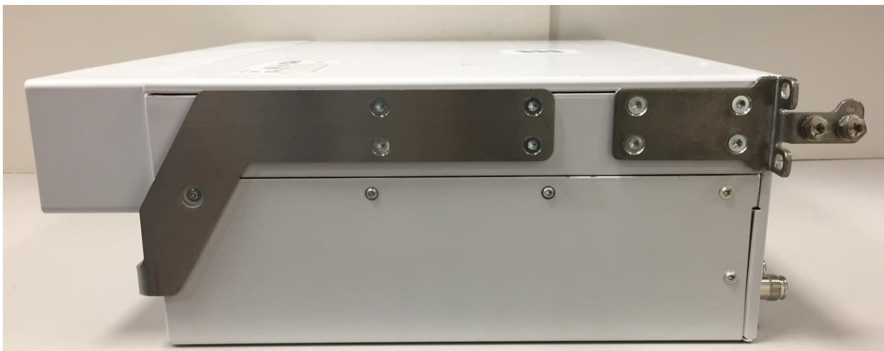
Figure 6: LPRU 4420 B25B66 Left View