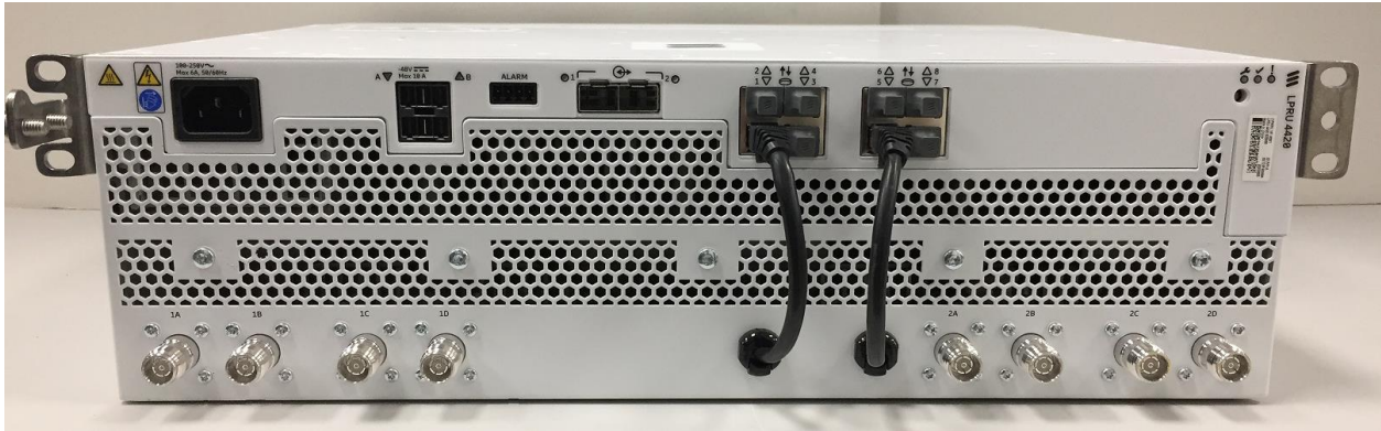
Figure 1: LPRU 4420 B25B66 Front View