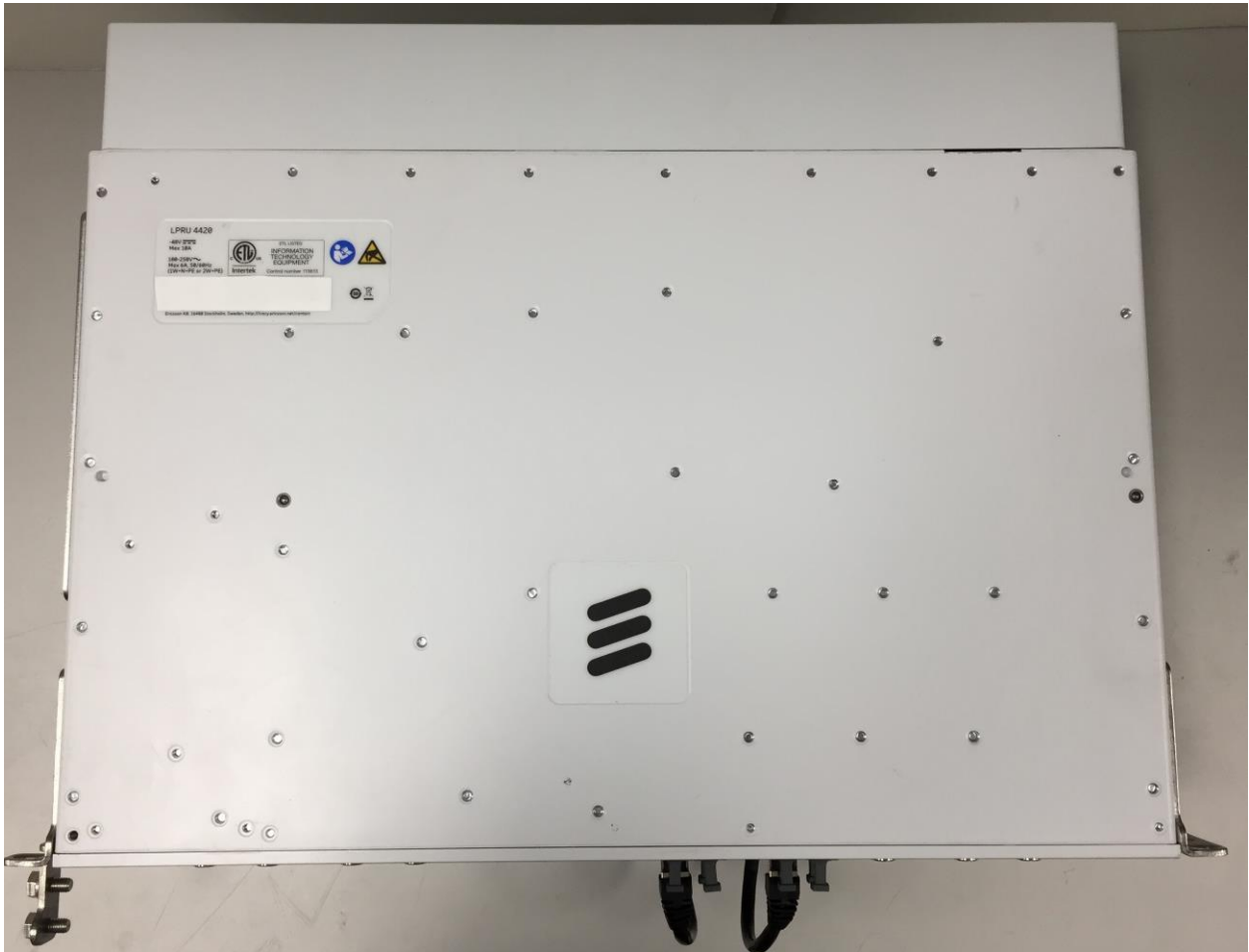
Figure 2: LPRU 4420 B25B66 Top View