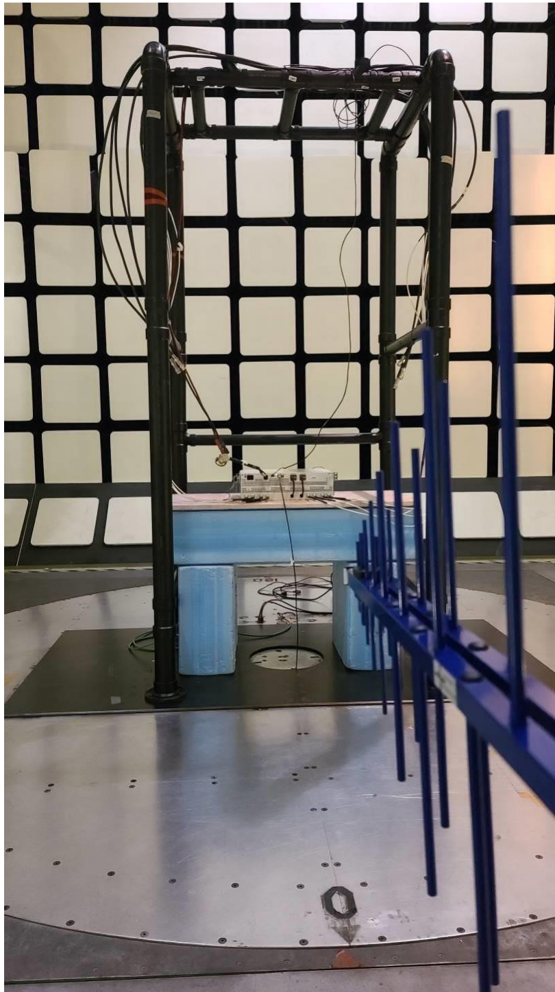
Figure 1: Radiated Test setup