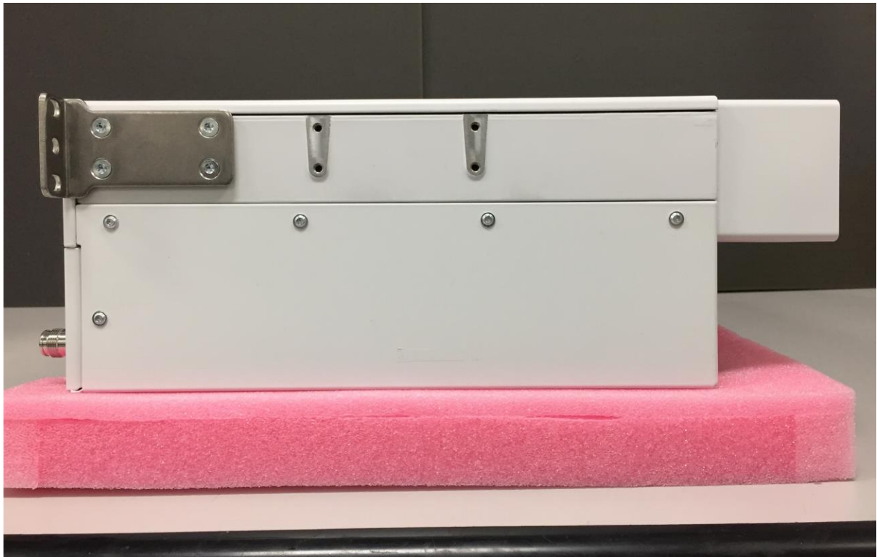
Figure 5: LPRU 4410 B5B13 Right View