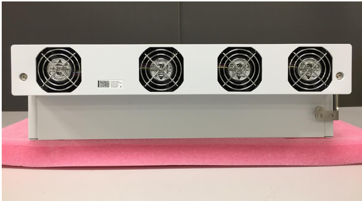
Figure 3: LPRU 4410 B5B13 Rear View