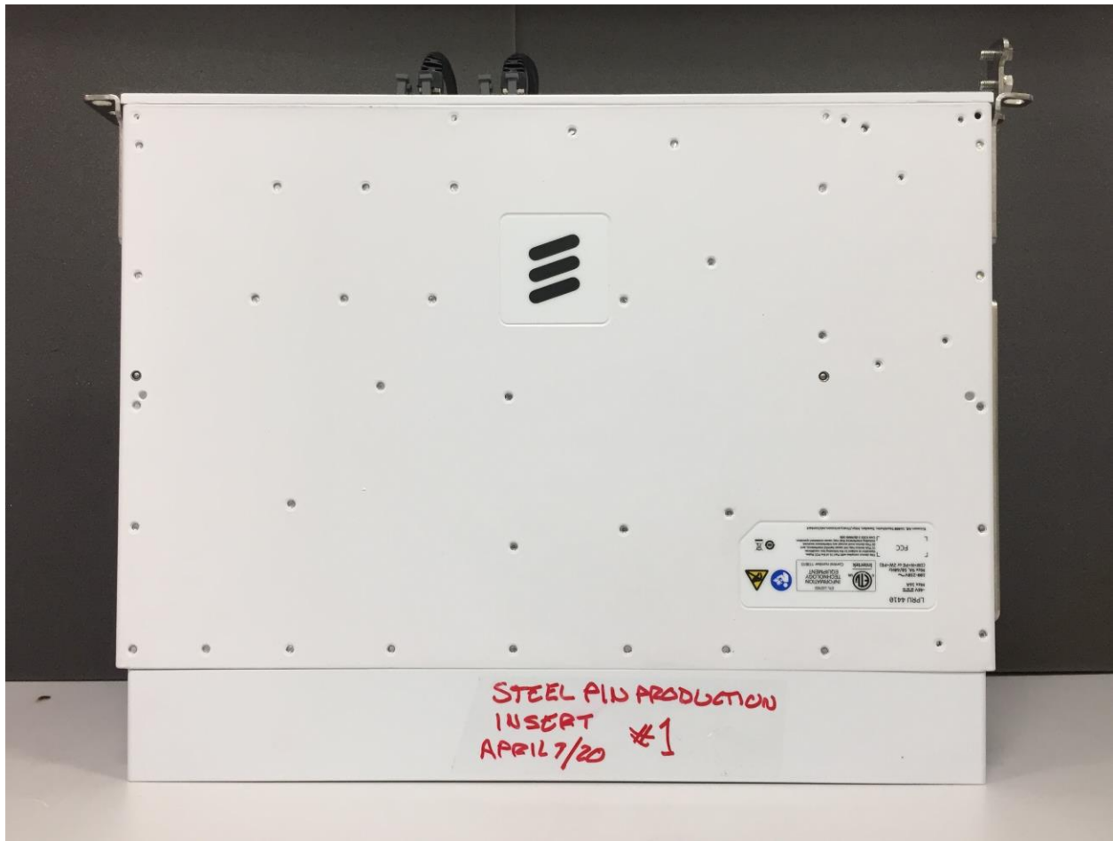
Figure 2: LPRU 4410 B5B13 Top View