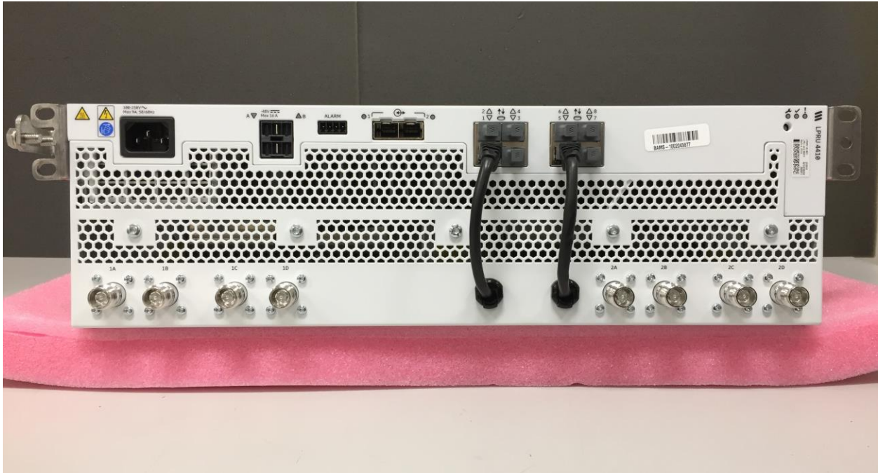
Figure 1: LPRU 4410 B5B13 Front View