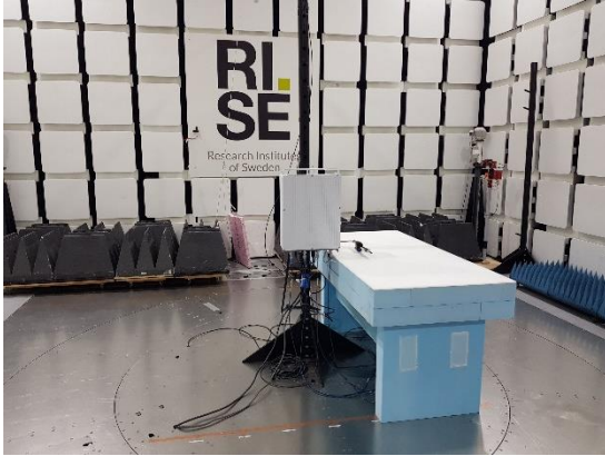
Test setup 30-1000 MHz: