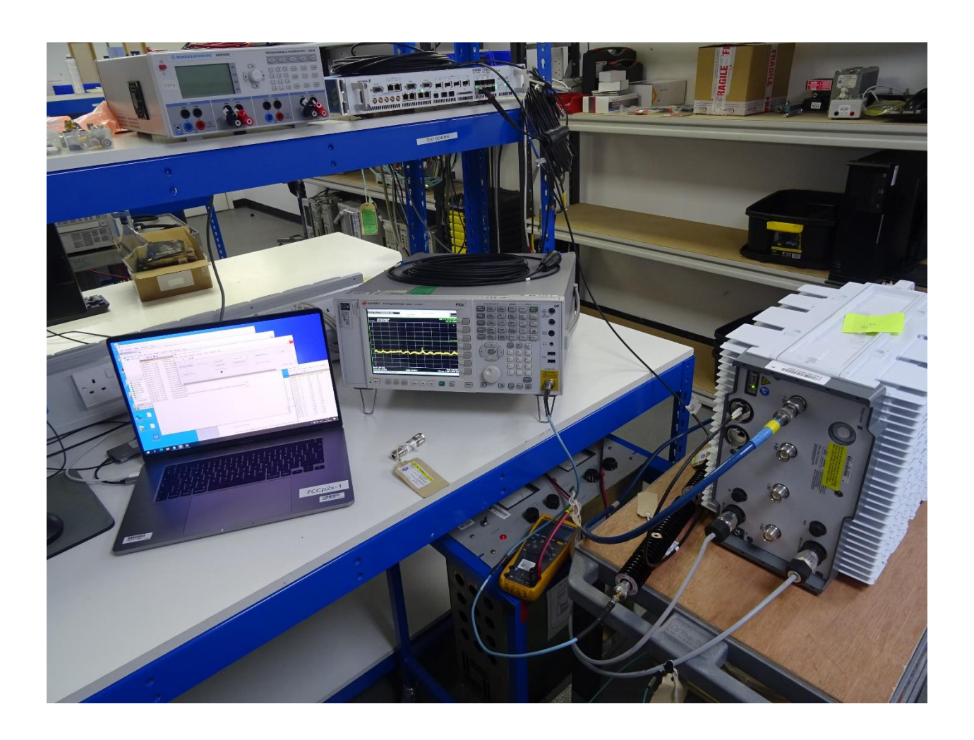
Conducted Lab Testing