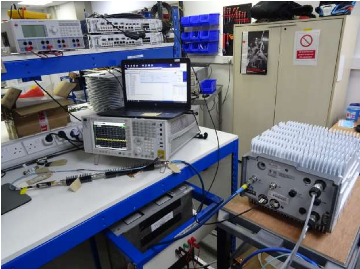
Conducted Lab Testing