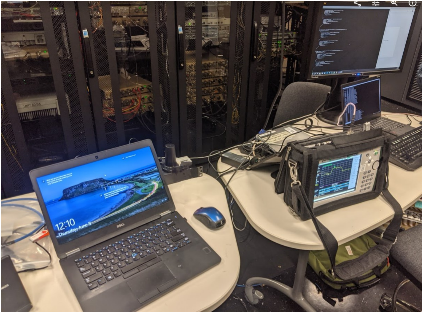
Figure 1.1-1: SAS Testing Set up photo