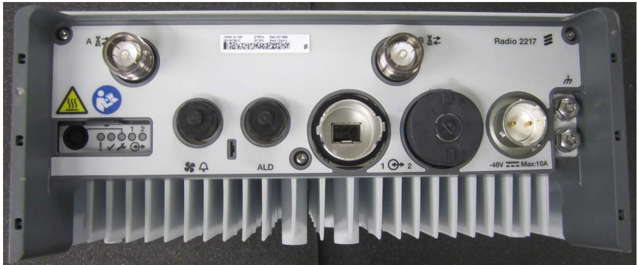
Figure 6: Radio 2217 B66A Bottom / Connector View