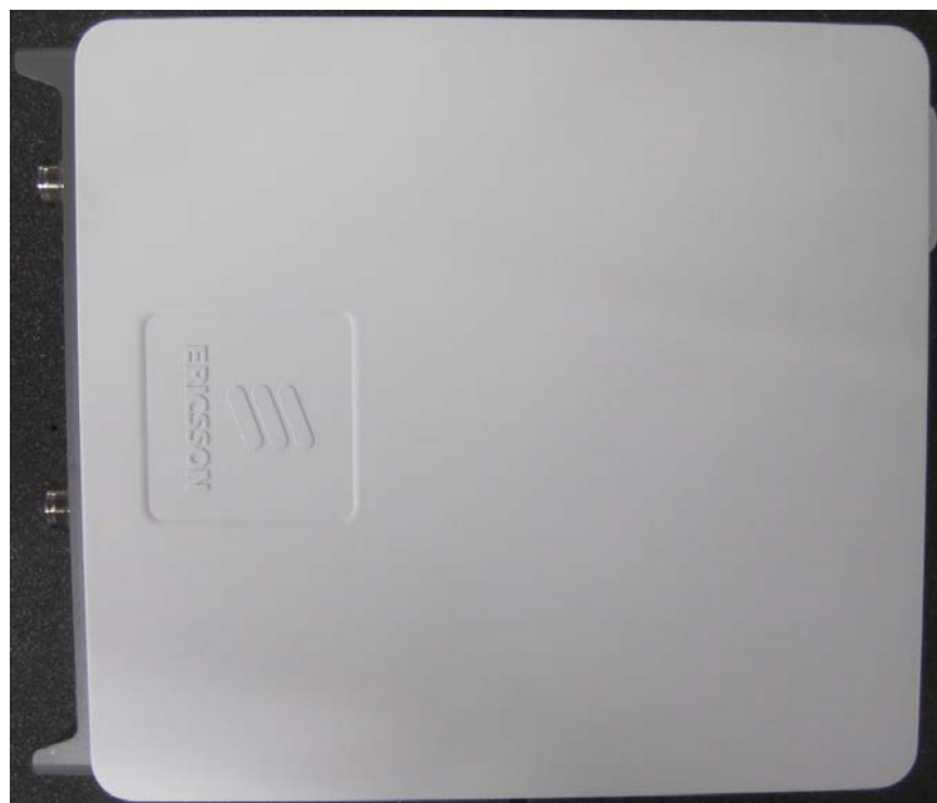
Figure 3: Radio 2217 B66A Front View