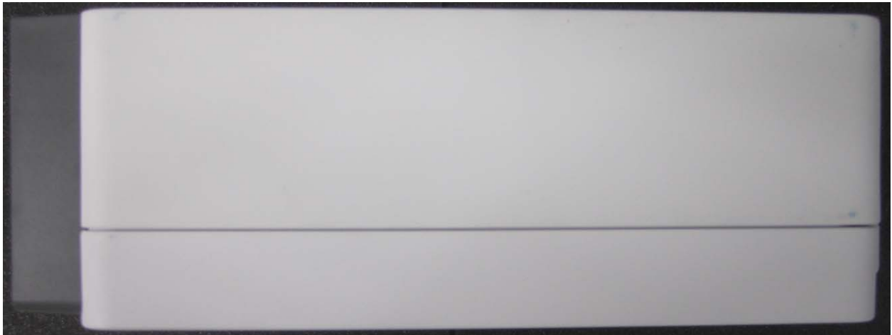
Figure 9: Radio 2217 B66A Left Side View