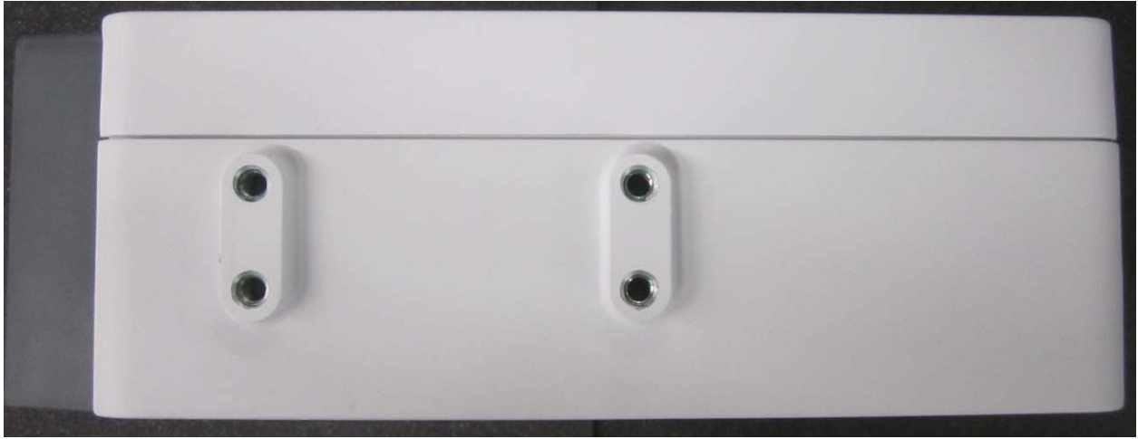
Figure 8: Radio 2217 B66A Right Side View