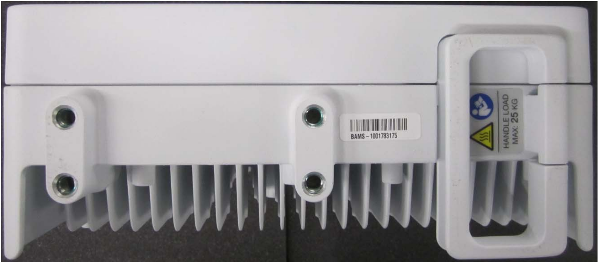
Figure 4: Radio 2217 B66A Top View