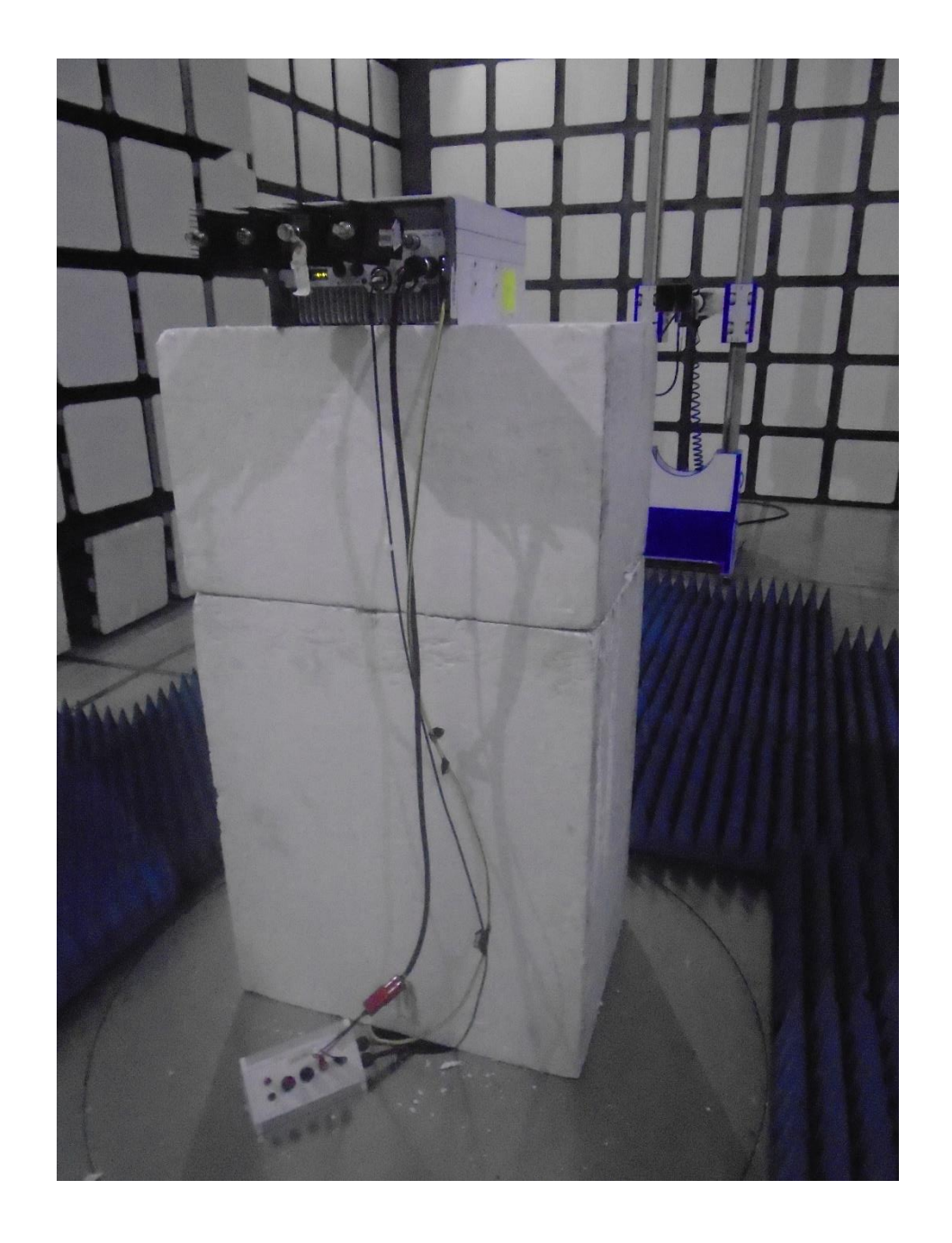
Radiated Testing 1GHz - 8GHz