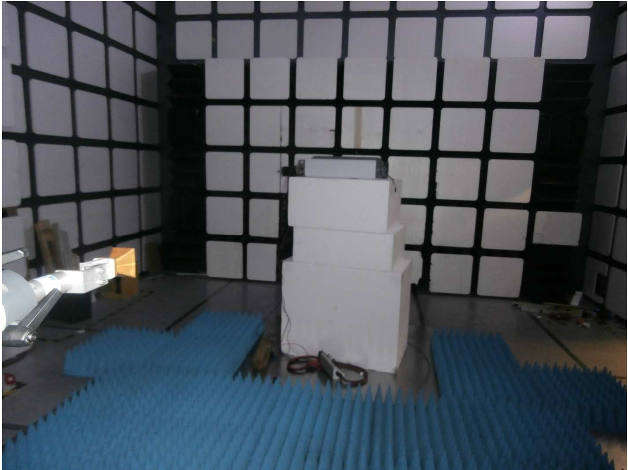
Radiated Emissions 18 GHz to 22 GHz