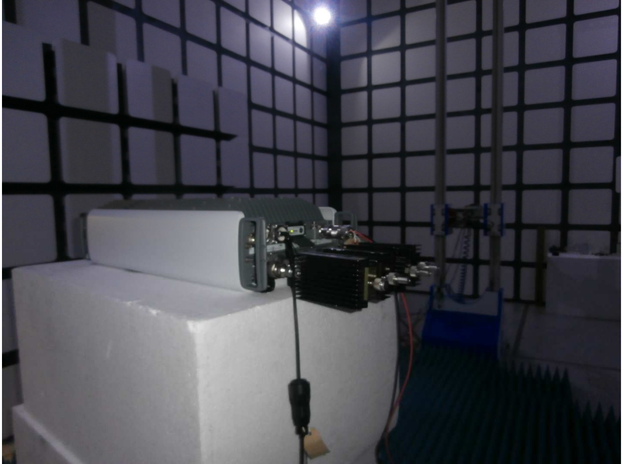
Radiated Emissions 8 GHz to 18 GHz