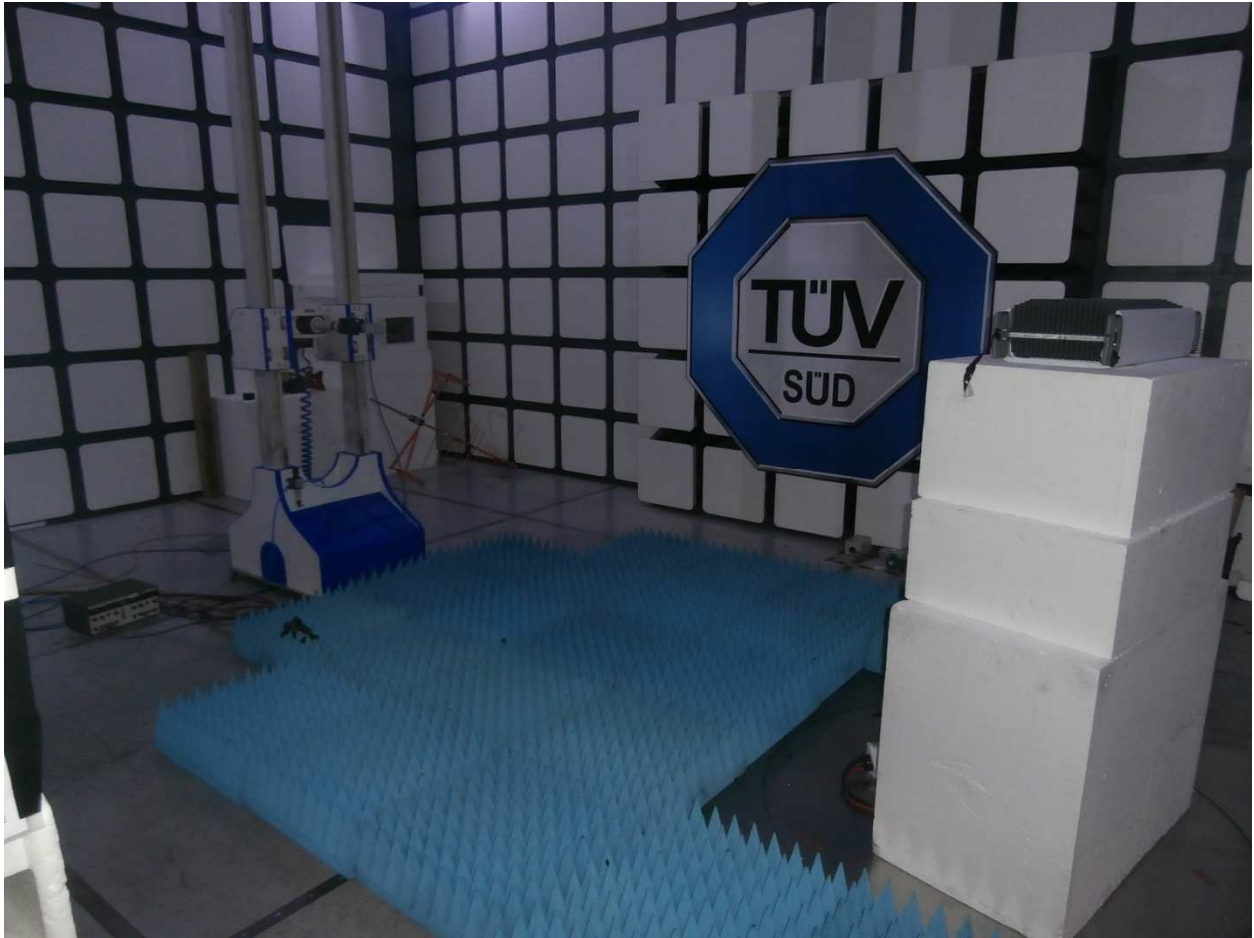
Radiated Emissions 1 GHz to 8 GHz