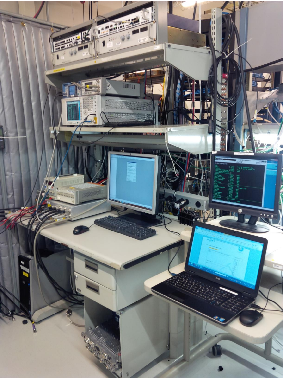
Figure 3: Conducted Test Equipment