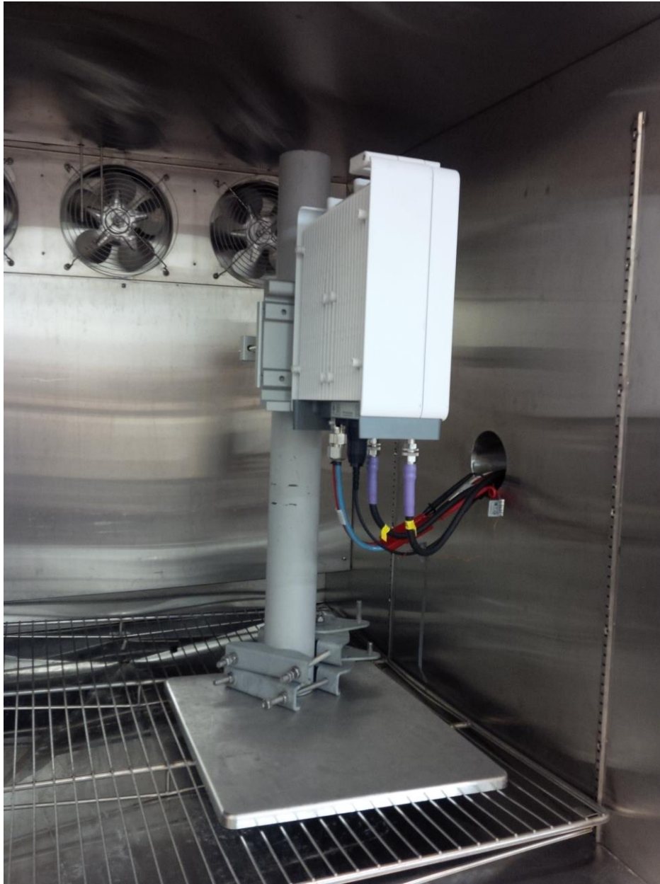
Figure 4: EUT in a thermal test chamber