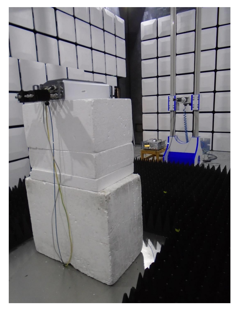
Radiated 18GHz - 22GHz Testing