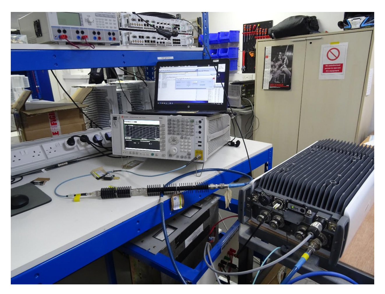
Conducted Lab Testing