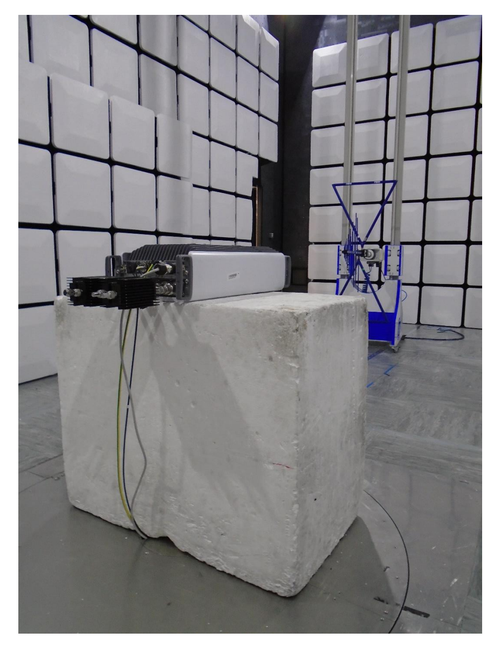
Radiated 30 MHz - 1GHz Testing