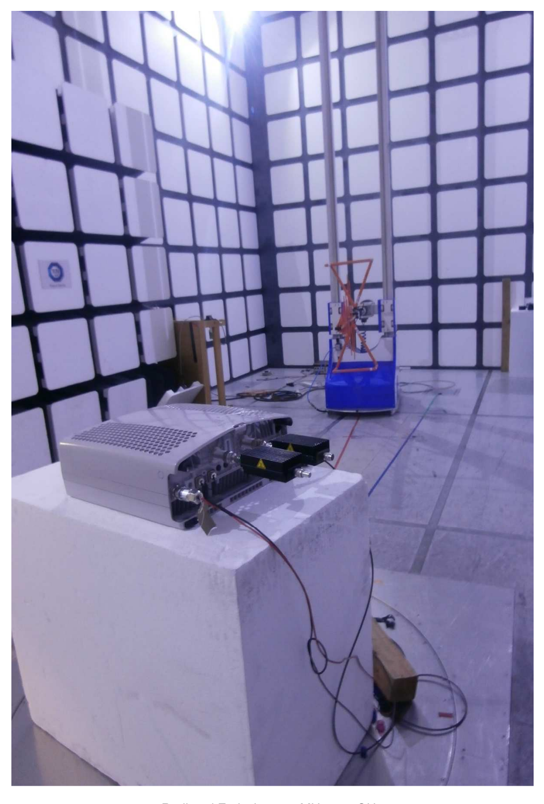
Radiated Emissions 30 MHz to 1 GHz