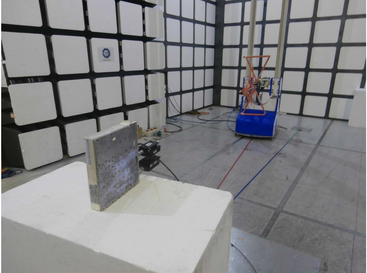
Radiated Emissions 30 MHz to 1 GHz