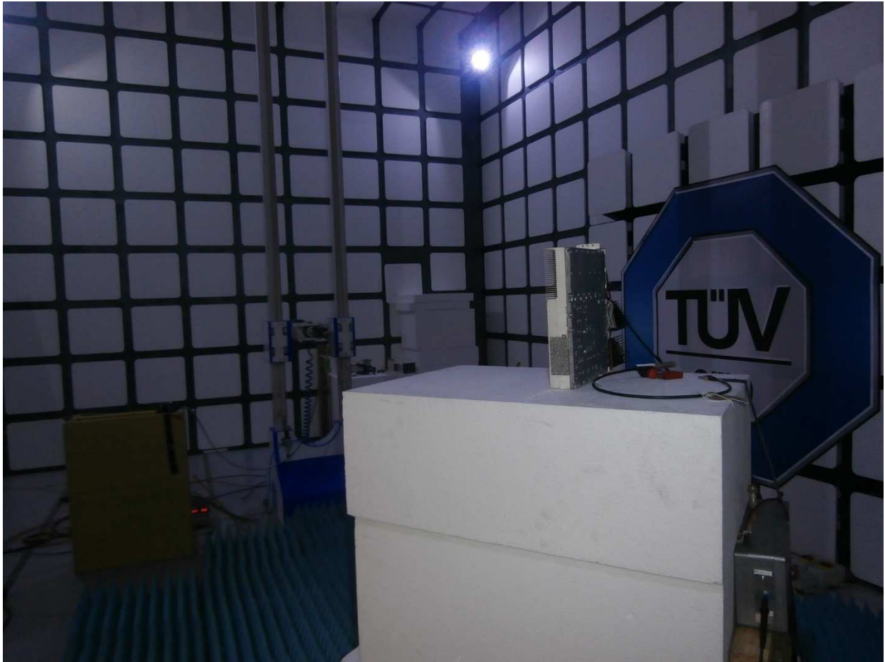
Radiated Emissions 8 GHz to 18 GHz