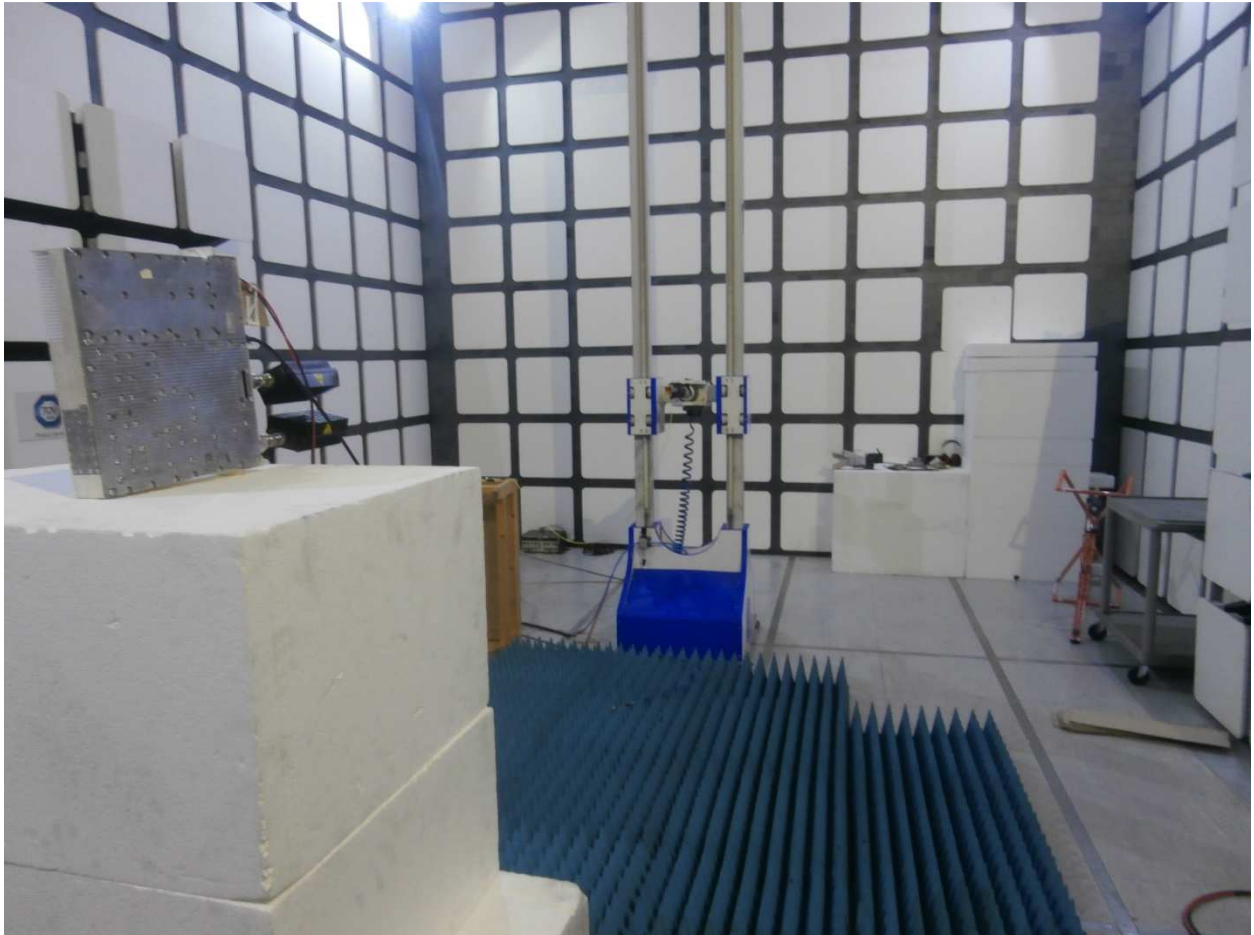
Radiated Emissions 18 GHz to 20 GHz