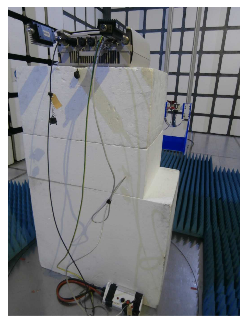
Radiated Emissions 1 GHz to 9 GHz