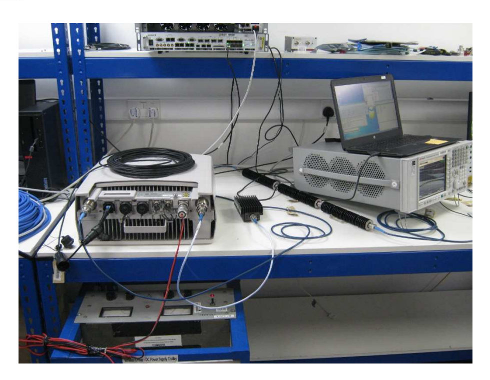
Conducted Lab Testing