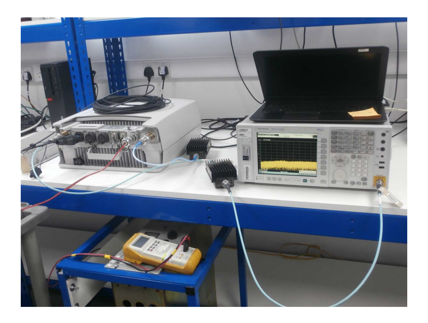
Conducted Lab Testing

Page 3 of 3 Reference: 75942505 Report 07