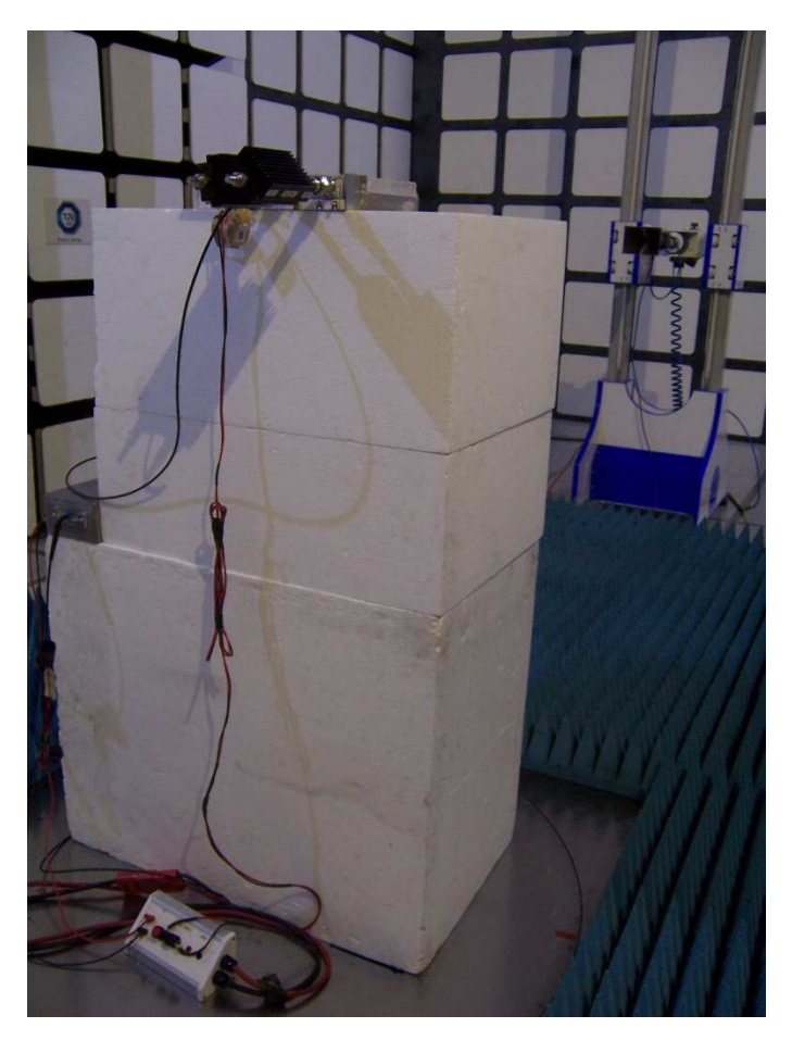
Radiated Emissions 1 GHz to 18 GHz