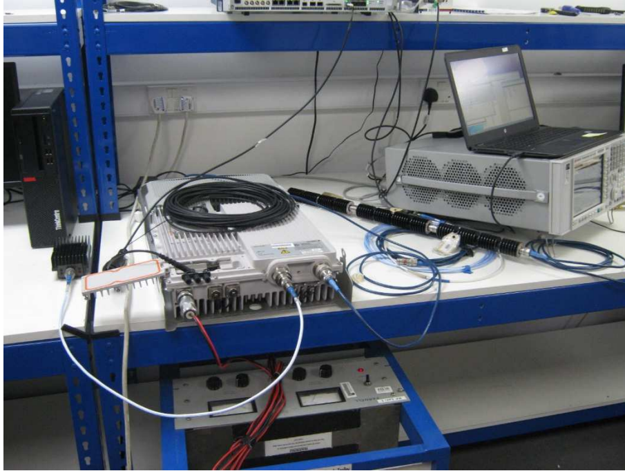
Conducted Lab Testing