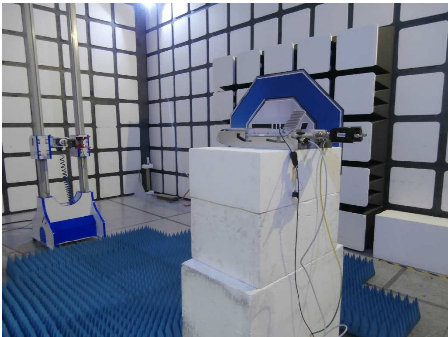
Radiated Emissions 1 GHz to 9 GHz