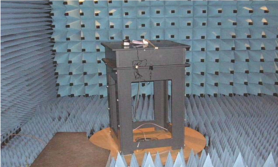
Radiated spurious emission 1-26 GHz