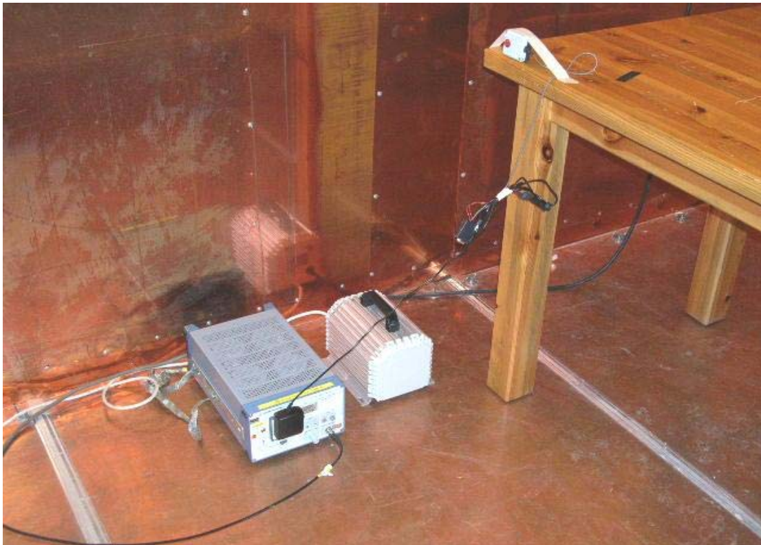
Conducted disturbance voltage in the frequency range 0,15 - 30 MHz