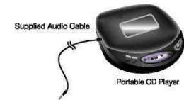
Portable CD Player