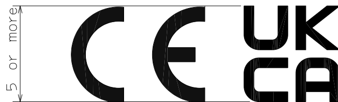
CE marking、UKCA marking detail (5:1)