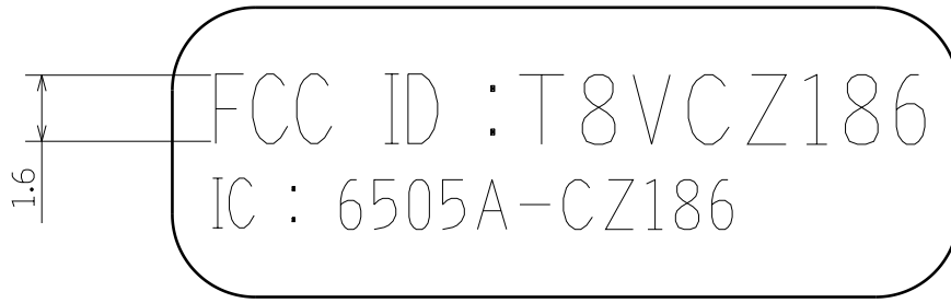
FCC,ISED Notation detail (5:1)