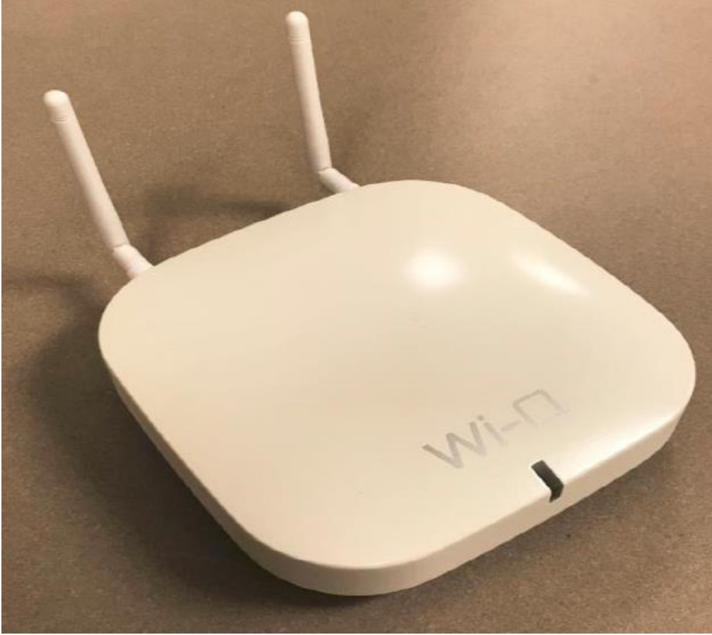
Top of WiQ Portal Gateway