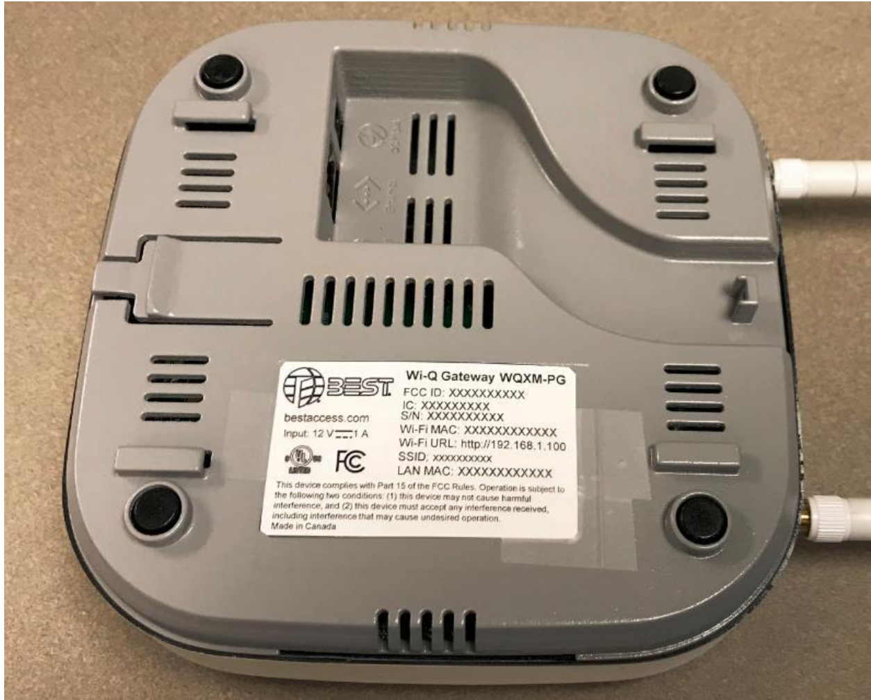
Bottom of WiQ Portal Gateway