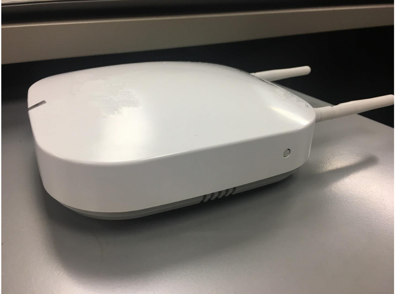
Profile of WiQ Portal Gateway