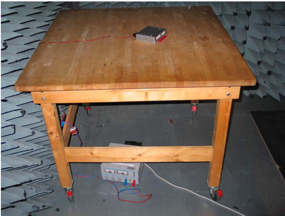
Photo 2: Test setup for radiated measurements (Enclosure, below 30 MHz)