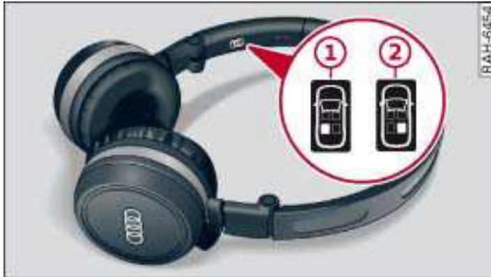
Figure 106 Wireless Headphones feature

procedure must be run separately for the left / right wireless headphones. Depending on which side of the RSE control unit to start the learning process, the wireless headset to the left / right RSE display is assigned. The assignment of the headphones to the left / right RSE display is marked with a sticker.