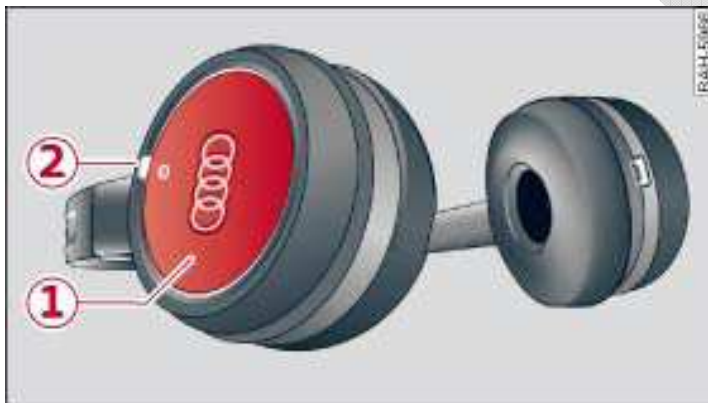
Figure 105 wireless headphones on and off

Switch wireless headphones on/off ( Applies only to vehicles with Rear Seat Entertainment )