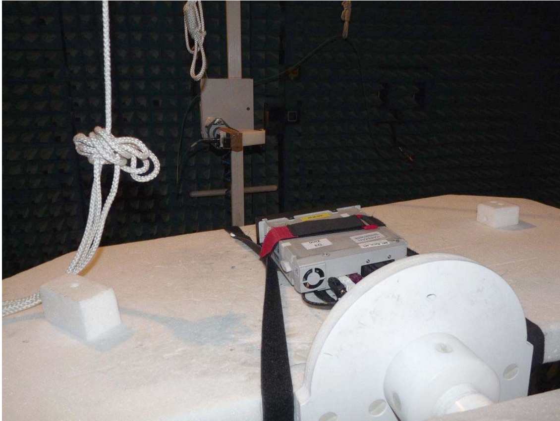
Photo 4: Test setup for radiated measurements (Enclosure, fully-anechoic chamber, 18-25 GHz, intentional radiator § 15, EUT NBT RSE / 43090a01)