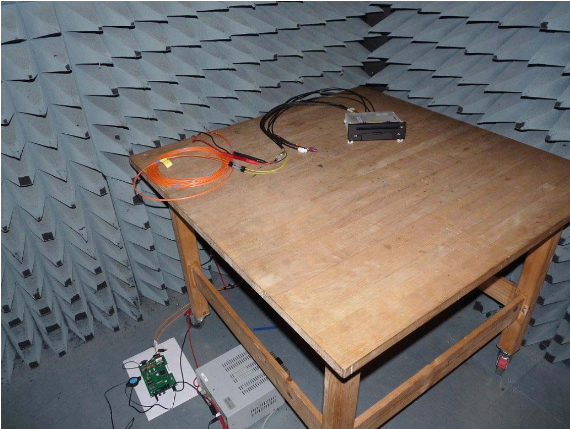
Photo 1: Test setup for radiated measurements (Enclosure, below 30 MHz, intentional radiator §15, EUT NBT RSE / 43090a01)