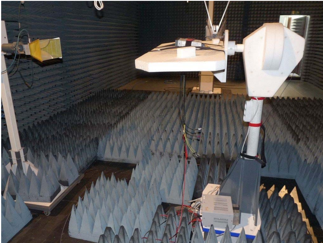
Photo 3: Test setup for radiated measurements (Enclosure, fully-anechoic chamber, 1-18 GHz intentional radiator S15, , EUT NBT RSE / 43090a01)