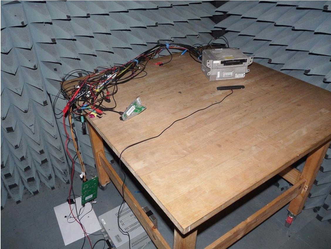
Photo 1: Test setup for radiated measurements (Enclosure, below 30 MHz, intentional radiator §15, EUT NBT HU / 43080a01)