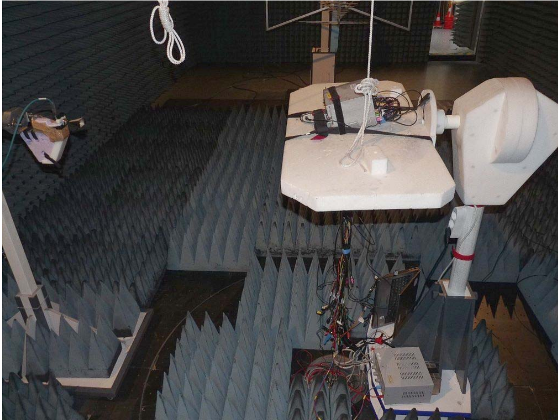
Photo 4: Test setup for radiated measurements (Enclosure, fully-anechoic chamber, 18-25 GHz, intentional radiator § 15, EUT NBT HU / 43080a01)