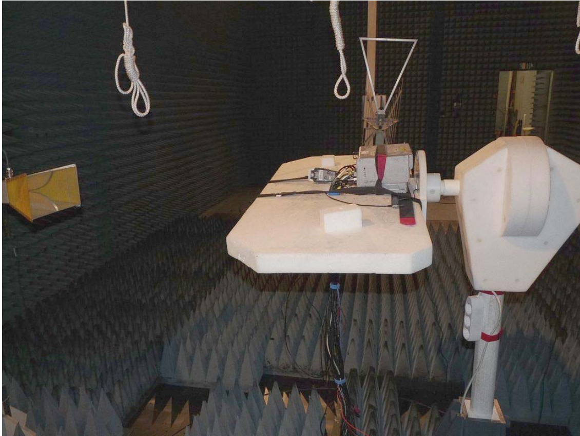
Photo 3: Test setup for radiated measurements (Enclosure, fully-anechoic chamber, 1-18 GHz intentional radiator S15, EUT NBT HU / 43080a01)