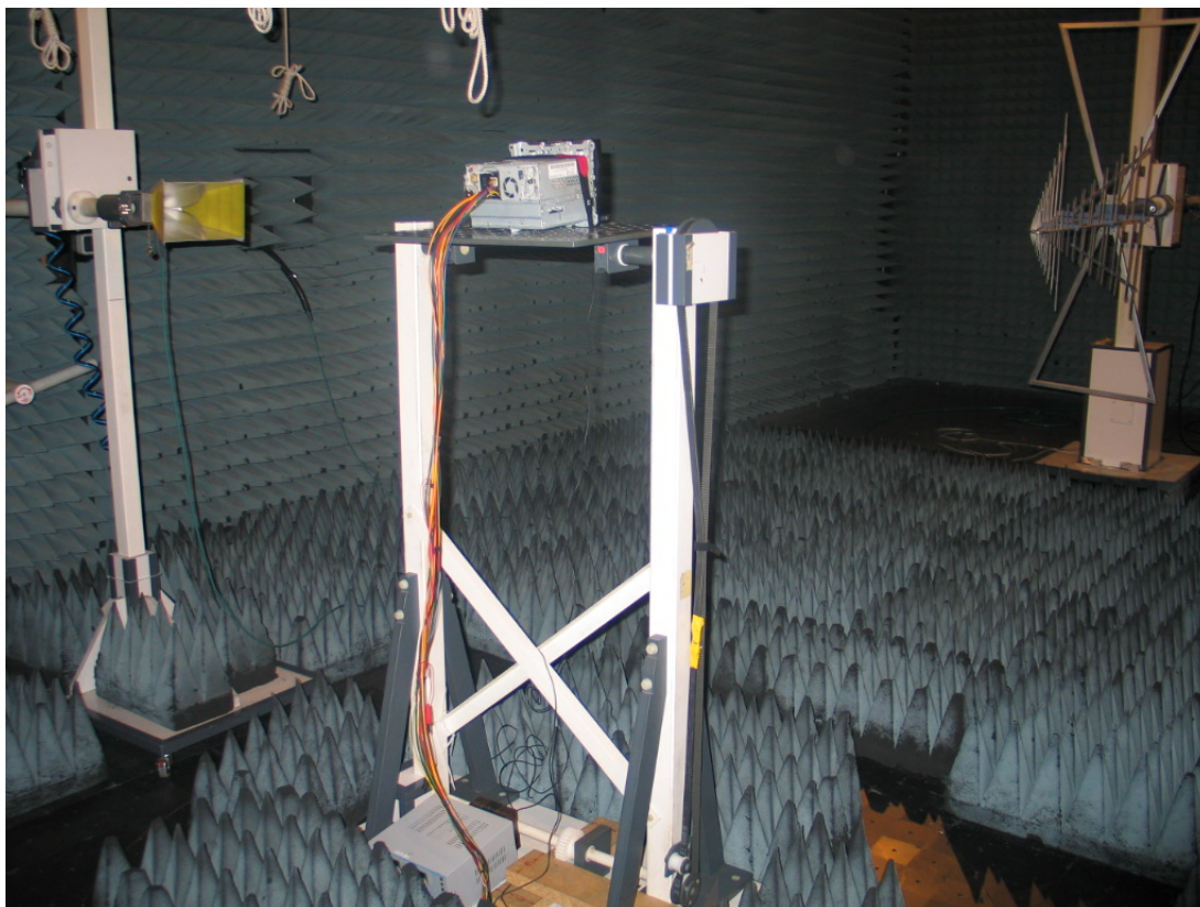
Photo 3: Test setup for radiated measurements (Enclosure, above 1 GHz)