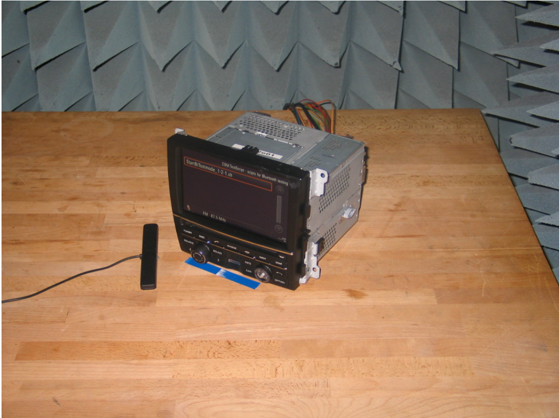
Photo 1: Test setup for radiated measurements (Enclosure, below 30 MHz)