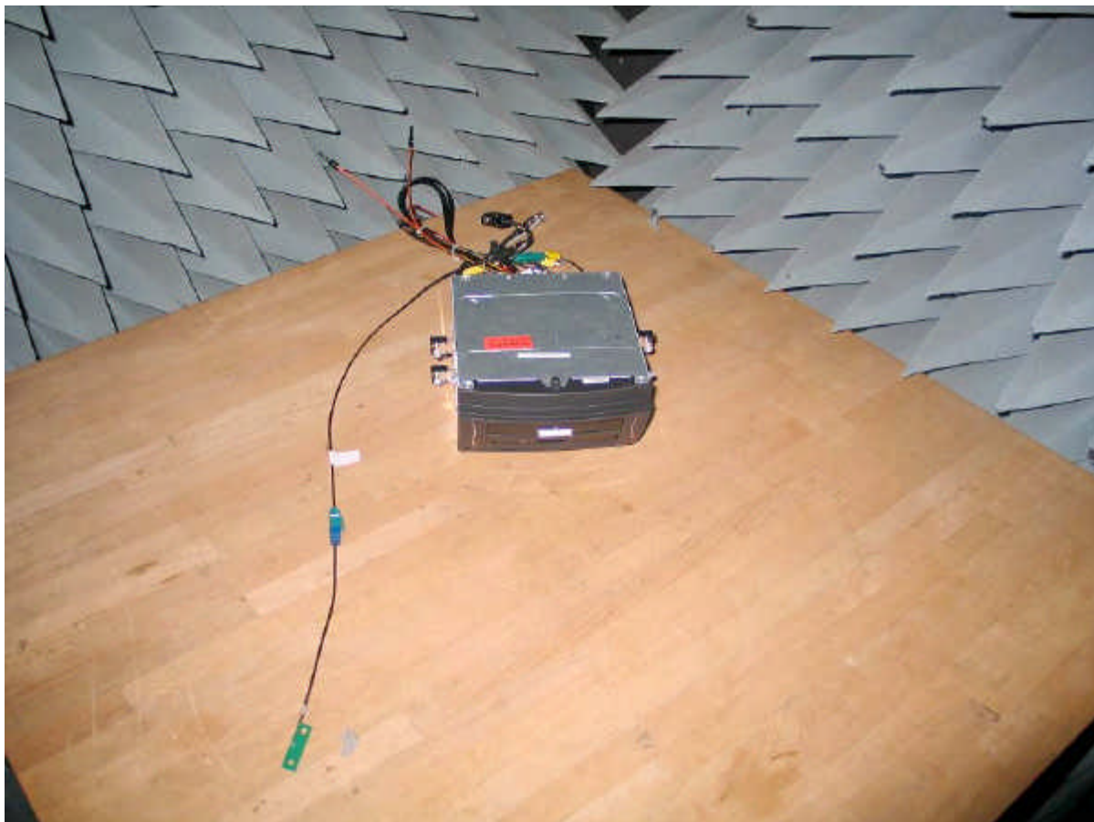
Photo 1: Test setup for radiated measurements (Enclosure, below 30 MHz)