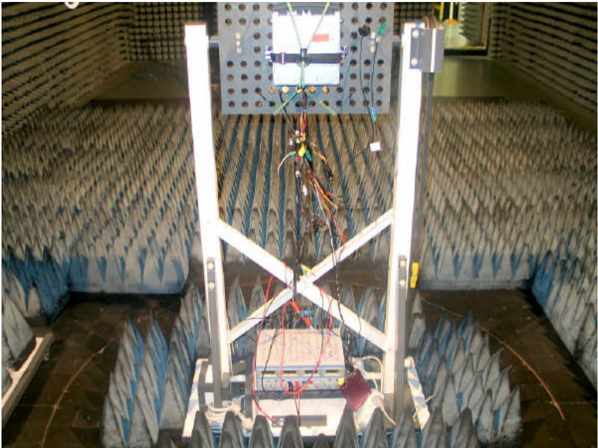
Photo 3: Test setup for radiated measurements (Enclosure, above 1 GHz)