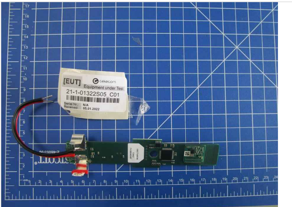
Photograph 2: EUT 1_under side view