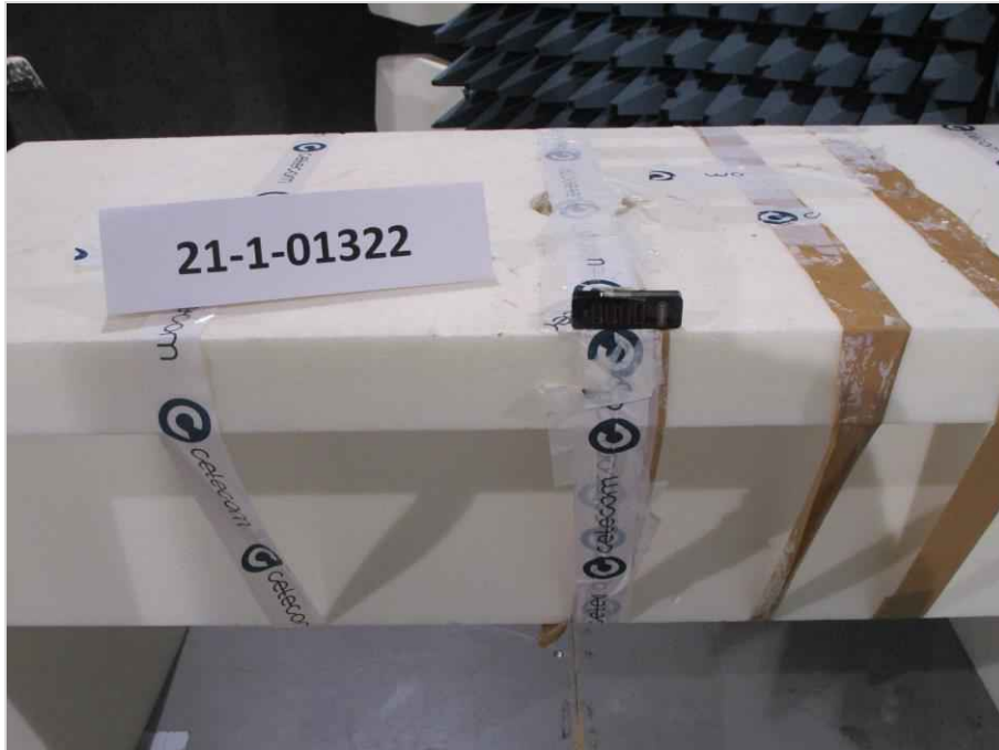
Photograph 1: EUT Test Setup in the semi anechoic chamber, Electric Field Strength