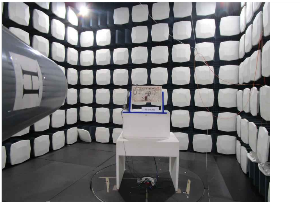
Photograph 4: EUT Test Setup in the fully anechoic chamber, Electric Field Strength