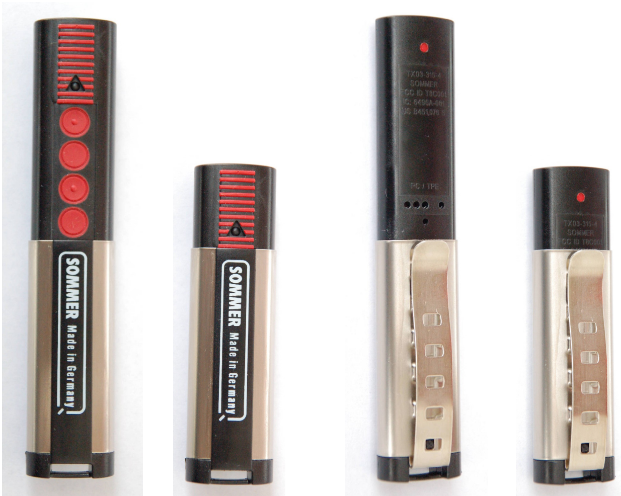
Rear view closed position

The device identifier is on the rear side of the device engraved into the mould of the plastic part. Picture of the device identifier: