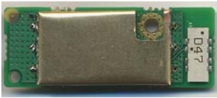
Figure 1: TMW11B Wireless Radio Module