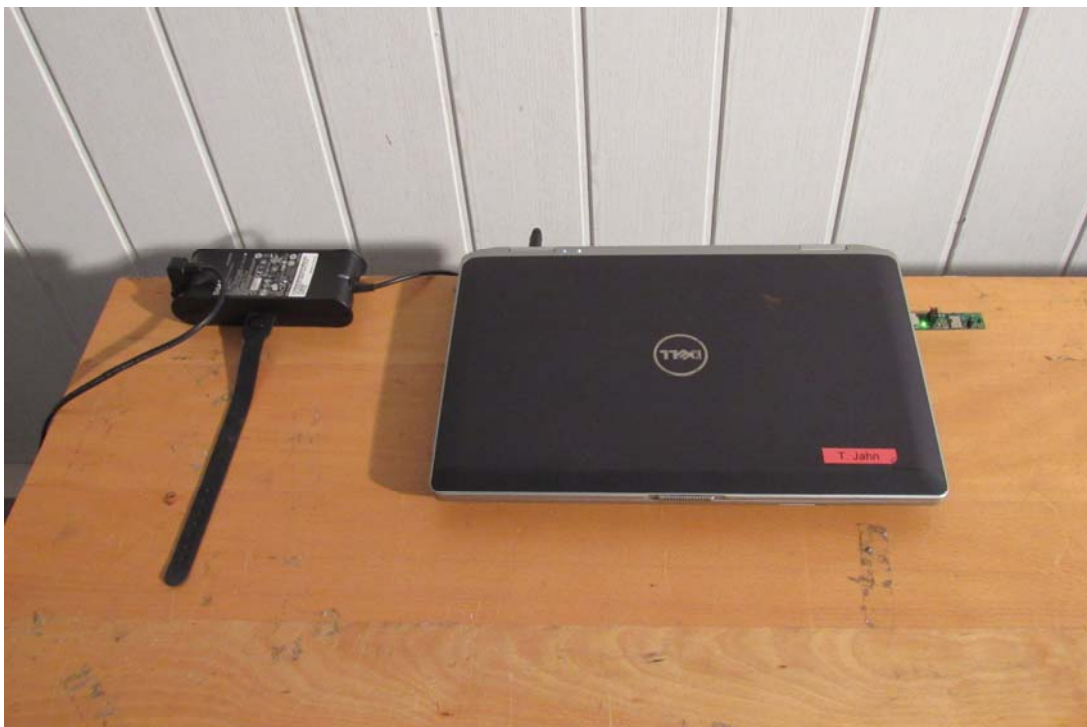
AC power line