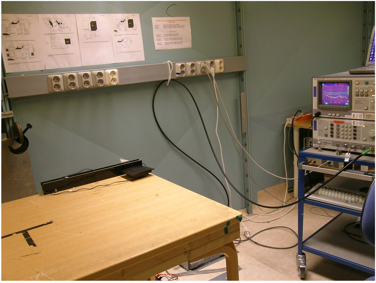
Power line Conducted Emissions Test