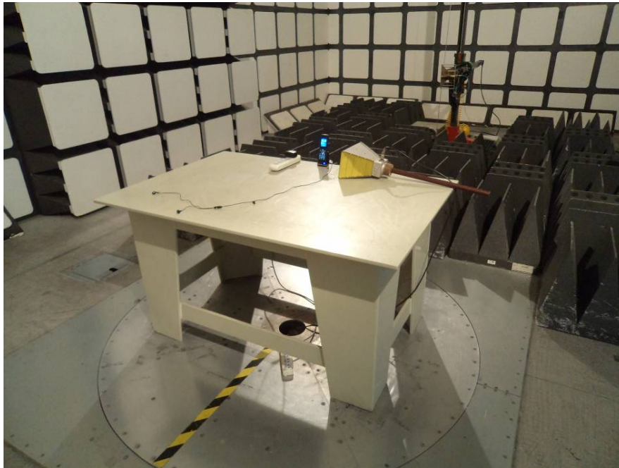
Radiated Emissions – Rear View (1-25 GHz)