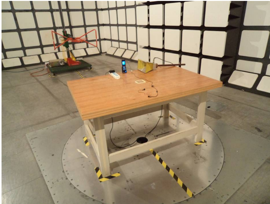
Radiated Emissions – Rear View (30-1000 MHz)