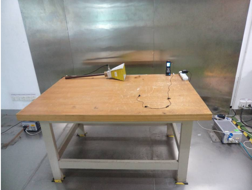
Conducted Emissions – Side View